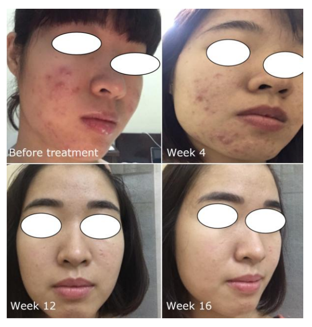
Figure 3: 26 years old female from the studied group (Isotretinoin + Desloratadine)

The studied group had a significantly lower outbreak rate than that in the control group with p < 0.05 at week 2 and 4. At week 16, both groups had no outbreaks.