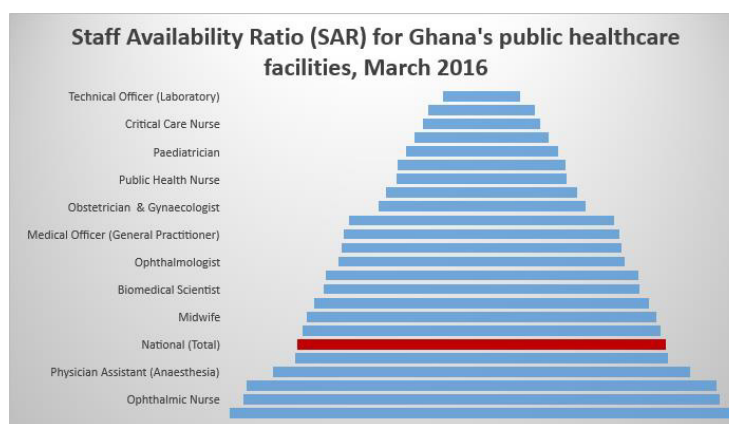
Figure 3. Staff-Availability Ratio (SAR) in Ascending Order of Existing Staffing Deficit (March 2016).