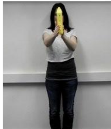
D: Test video 2