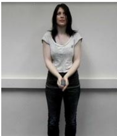
C: Test video 1