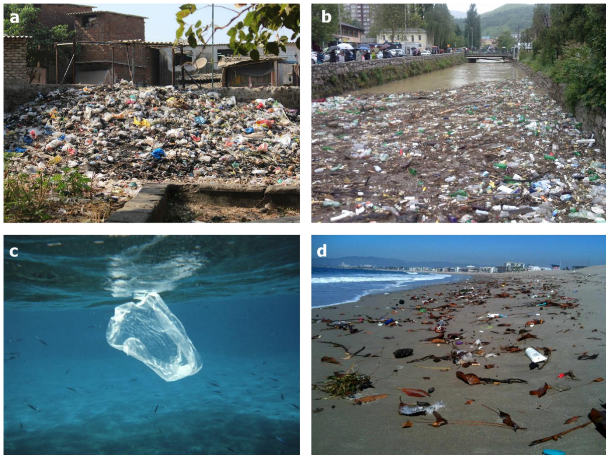
Fig. 2. Images of plastic pollution across a range of environments a) terrestrial, b) riverine, c) marine and d) coastal. Any large items can degrade to form secondary microplastics.

Although the majority of freshwater microplastic studies tend to focus on rivers, it is understood that microplastics are also prevalent within ponds and lakes. 23-25 In the same way as rivers, these will receive inputs from land runoff and wind-blown debris, however due to the enclosed nature of lakes it is likely that inputs of microplastics to standing waterbodies will lead to accumulation over time. 23