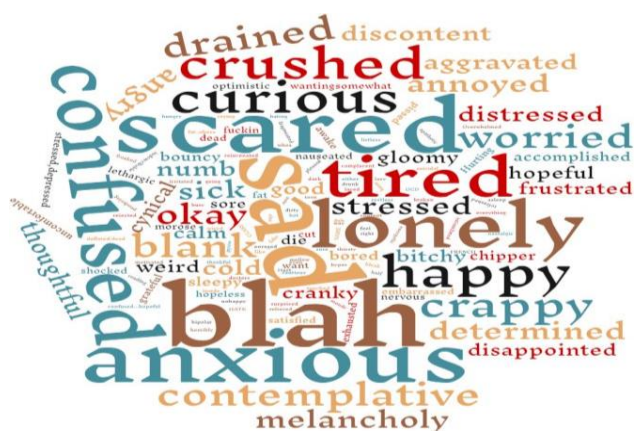
Figure 4. Word cloud for moods of depressive posts.

The post classification and community classification results from Tables 4, 5, and 6 demonstrate the promise of the proposed method which provided a high degree of precision, recall, and accuracy. These results show that the ratio of misclassification for depressive posts and depressive communities is lower in comparison to misclassified non-depressive posts and non-depressive communities, respectively. This is due to the reason that depressive communities mostly contain posts relevant to depression. However, non-depressive community users discuss various aspects of life and sometimes express their feelings of depression and thus potentially making the post a candidate for depressive class. The classification of such outliers is indeed a big challenge. Based on passive writing style and sentiments of these apparently non-depressive posts from non-depressive communities, the classifier labelled them as depressive posts that contradicted with the ground truth of the dataset.