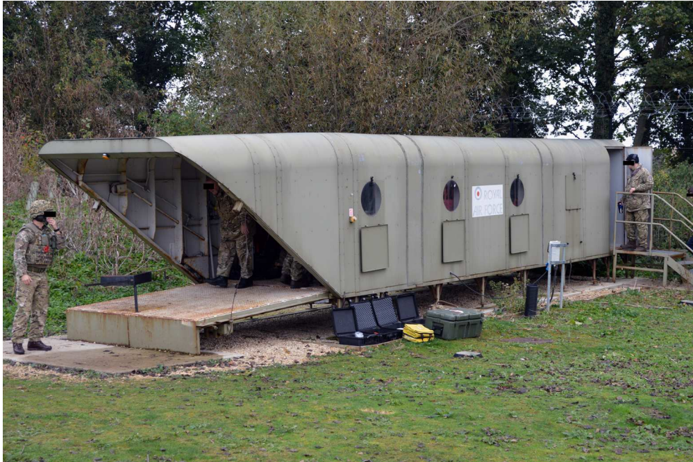
Figure 1: Chinook facsimile trainer at the Tactical Medical Wing of RAF Brize Norton.