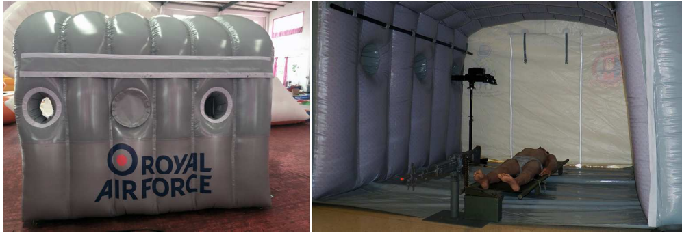
The basic MERT inflatable enclosure, external and internal views.

1 2 3 4 5 6 7 8 9 10 11 12 13 14 15 16 17 18 19 20 21 22 23 24 25 26 27 28 29 30 31 32 33 34 35 36 37 38 39 40 41 42 43 44 45 46 47 48 49 50 51 52 53 54 55 56 57 58 59 60