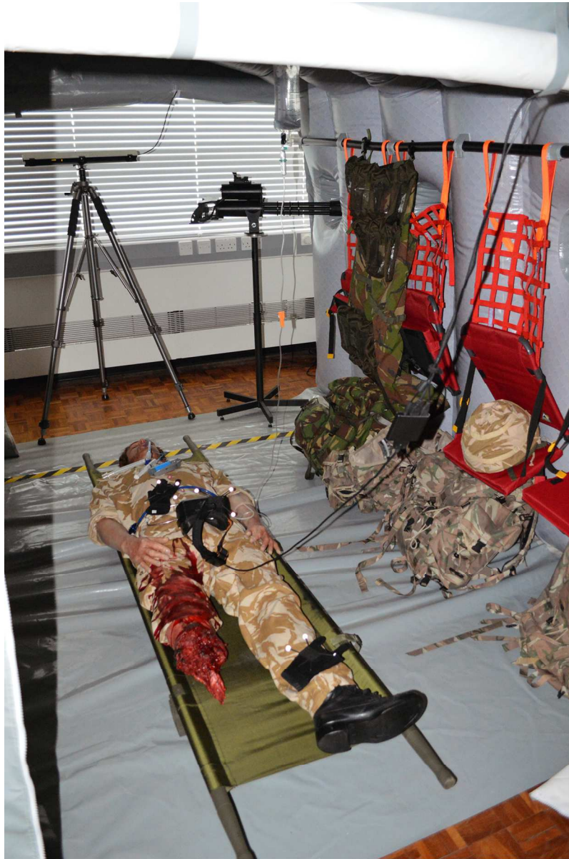
Figure 5: Inflatable enclosure with various additional elements, including a SIMBODIE mannequin.