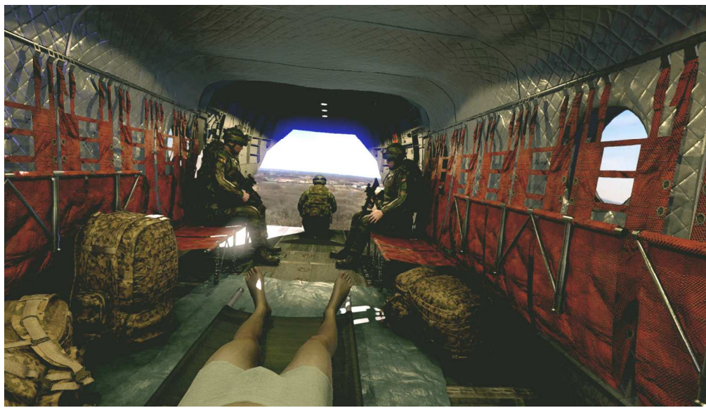
Figure 6: Interior view of the virtual Chinook cabin.

1 2 3 4 5 6 7 8 9 10 11 12 13 14 15 16 17 18 19 20 21 22 23 24 25 26 27 28 29 30 31 32 33 34 35 36 37 38 39 40 41 42 43 44 45 46 47 48 49 50 51 52 53 54 55 56 57 58 59 60