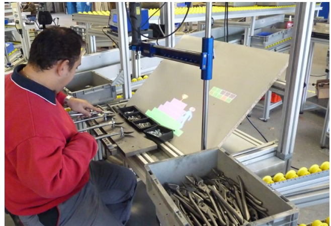
Figure 2. The augmentation and gamification of production workplaces created the technological expertise required to gamify learning processes in the STEM fields.

With a design study on “industrial playgrounds” in 2012 [10], gamification also extended into the area of production environments. In this domain, the combination of projection and motion recognition [8] allowed to create an augmented and gamified industry workplace (Figure 2). Several studies show that the system can be of help for both impaired and unimpaired workers [11,12]. Recent work evaluates the suitability of different gamification designs [13], including the pyramid method discussed later in this work.