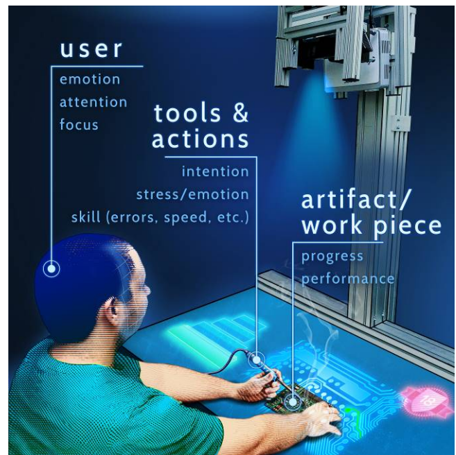
Figure 3. The design of the PCL system is based on three components: user, tools & actions, and artifact / workpiece.

On a technological level (Figure 3), PCL is a context-aware system which uses motion recognition to identify the learner’s actions (e.g. molding a wire to a circuit board) and object recognition to control the results (e.g. checking if the solder joint is at the right position).