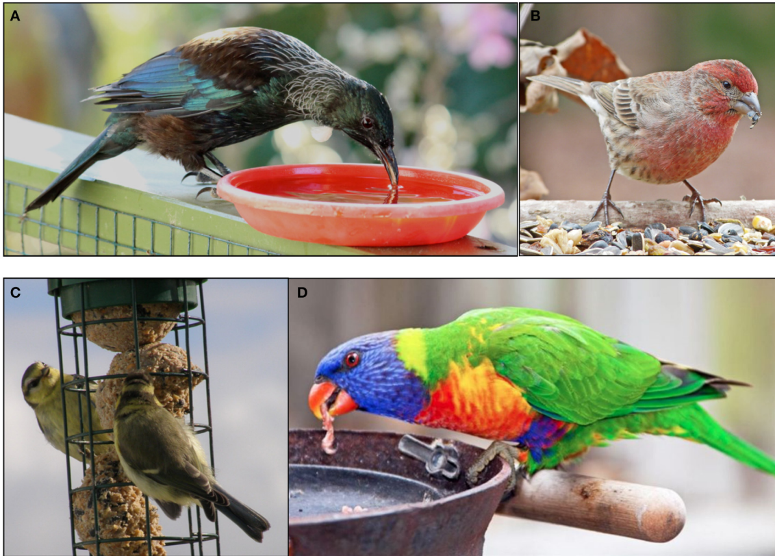
FIGURE 1 | Examples of bird species feeding on food supplements in city gardens in (A) New Zealand (tui Prosthemadura novaeseelandiae ) (Photo: J. Galbraith), (B) the US (house finch Carpodacus mexicanus ) (Photo: B. Vuxinic), (C) the UK (blue tits Cyanistes caeruleus ) (Photo: J. Galbraith), and (D) Australia (rainbow lorikeet Trichoglossus moluccanus ) (Photo: D. Jones).