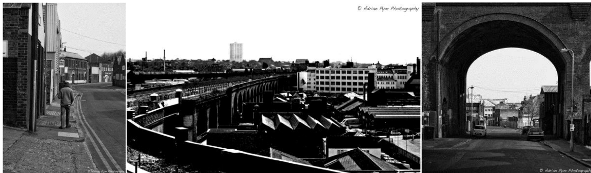
Figure 1. Views of Digbeth c.2000

Digbeth can trace its history back to the 12 th Century and an important trade route between Coventry and Birmingham; in the 18 th and 19 th Centuries it was a major centre of industry with many workers living there, often in poor conditions; today, all of the slum housing has been demolished and Digbeth is predominantly made up of low-rise, brick built factories and warehouses, with a scattering of grander Victorian architecture and ‘islands’ of terraced housing (see Figure 1) [Dargue, 2016].