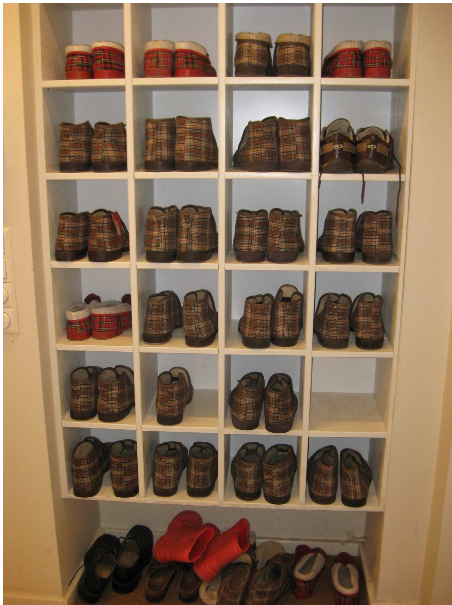
Figure 3: A shelf of employees' slippers 276x368mm (150 x 150 DPI)

1 2 3 4 5 6 7 8 9 10 11 12 13 14 15 16 17 18 19 20 21 22 23 24 25 26 27 28 29 30 31 32 33 34 35 36 37 38 39 40 41 42 43 44 45 46 47 48 49 50 51 52 53 54 55 56 57 58 59 60