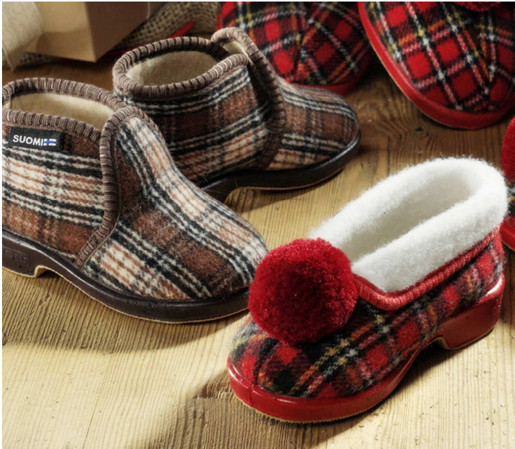
Figure 2: The Reino & Aino slippers 130x113mm (150 x 150 DPI)

1 2 3 4 5 6 7 8 9 10 11 12 13 14 15 16 17 18 19 20 21 22 23 24 25 26 27 28 29 30 31 32 33 34 35 36 37 38 39 40 41 42 43 44 45 46 47 48 49 50 51 52 53 54 55 56 57 58 59 60