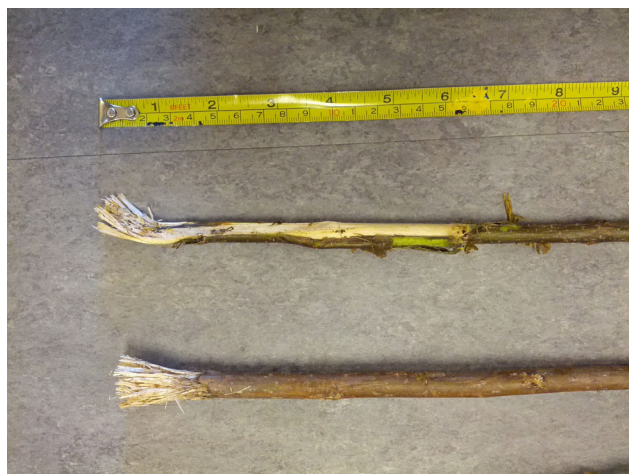
Fig. 2. A serviceberry tree shoot (above) collected and modified for use as a probe tool by a chimpanzee. Also shown for comparison (below) is a poplar stick, provisioned to the chimpanzees by keeper staff, also modified for use as a probe tool. NB: This photograph was taken of tools modified by this same group of chimpanzees in 2014, ten years after the data presented herein were collected.

were collected on 35 of these 56 days (i.e. Monday–Friday every week) from June 7th 2004–August 2nd 2004. These Baseline sessions were spread evenly throughout the Baseline period and all Baseline sessions were filmed for later analysis. During this period, the termite mound was never baited with food. The chimpanzees had no prior experience with obtaining food from this artificial mound and so this period represented a true behavioral baseline (see Lonsdorf et al. [2009] for full details of the chimpanzees’ background experiences).