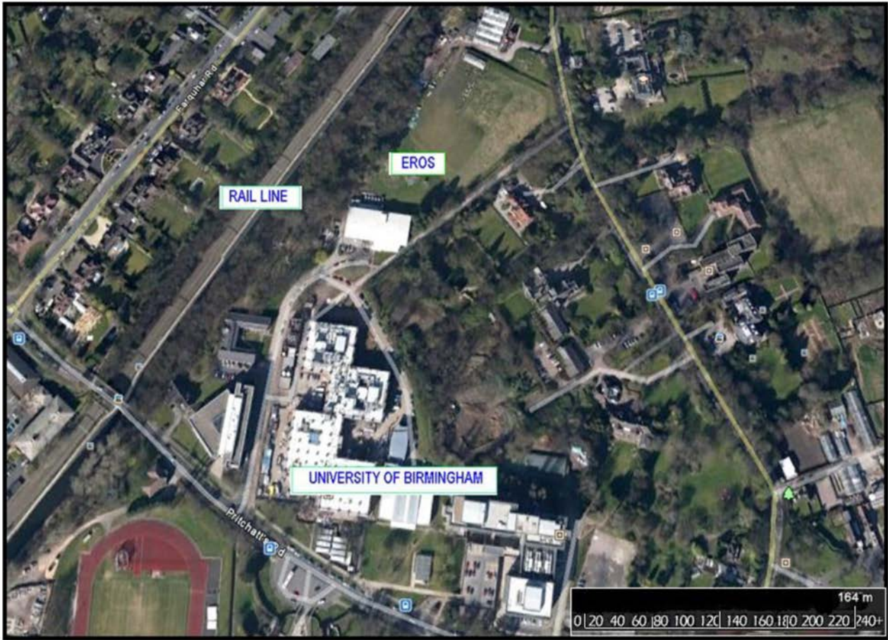
Map data: Google Earth 2010 ( http://www.google.com )