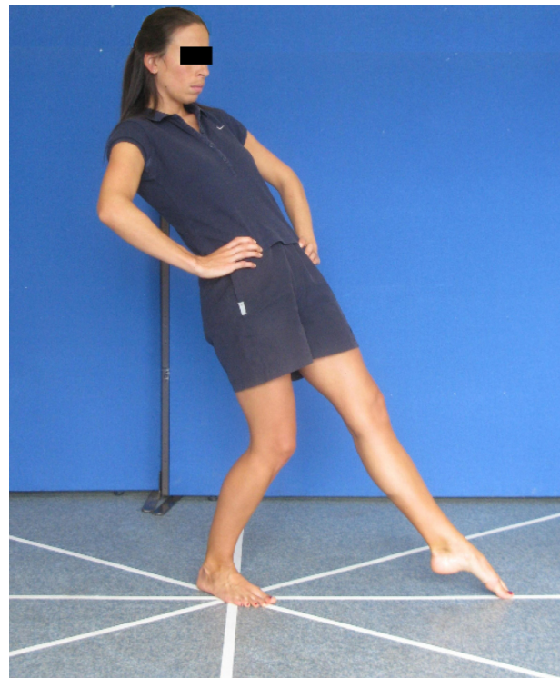
Figure 2 Participant performing anteromedial component of Star Excursion Balance Test on right leg, while leaning backwards and plantar flexing reaching foot. Right knee flexed to approximately 40°.

To be useful in clinical practice, the ART must demonstrate adequate measurement properties, including reliability, validity and responsiveness. 29 Reliability is often investigated first, being a prerequisite for the other properties. 30 In addition, it is recommended that initial studies of a new measure are conducted with healthy volunteers rather than patients, to exclude any variability