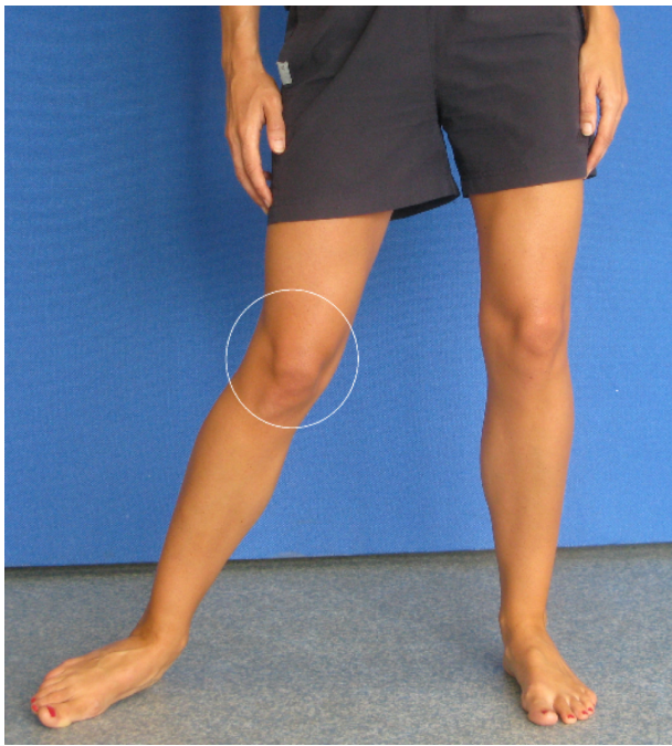
Figure 1 Dynamic lower extremity valgus.

the English National Health Service, 14 at an average cost of £1,500 per patient. 15