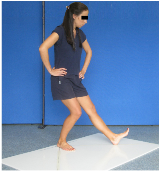
Figure 3 Participant performing Anteromedial Reach Test on right leg. Right knee flexed to approximately 60°.

due to fluctuation in symptoms. 31 For performance-based measures, where measurements are taken by a rater, both intrarater and interrater reliability are important. 32 Intrarater reliability is the extent to which measurements taken by the same rater are consistent, while interrater reliability is the extent to which measurements taken by different raters are similar. 29