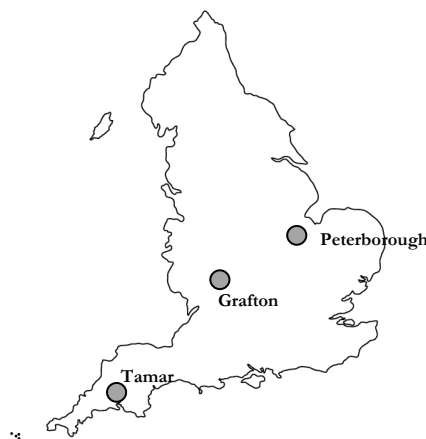
Figure 1: Case study locations in England.

The three case study areas were in Peterborough; Grafton, Worcestershire, and; Tamar valley, Devon/Cornwall (Figure 1). Between 10 and 12 interviews lasting between 45 minutes to 2 hours were conducted in each case study area.