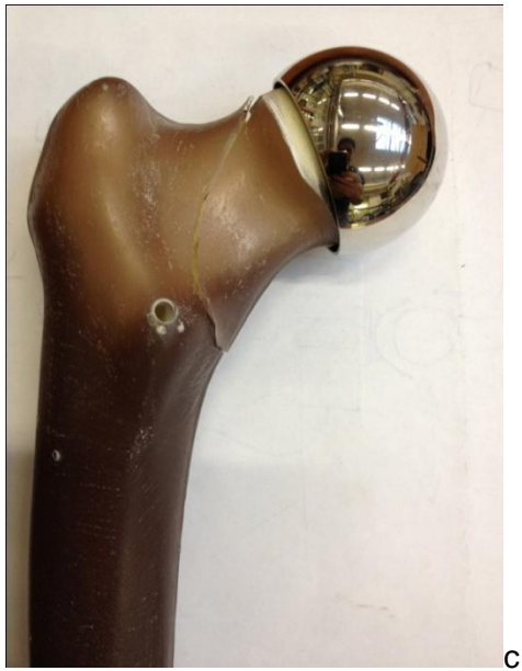
Figure 4. Fracture patterns seen in the femurs (a) crack initiated in the neck and roughly followed the intertrochanteric seen in the intact femurs; (b) crack initiated on the superior area of the neck and propagated towards the medial calcar seen in the femurs fitted with a BHR, BMHR-1 or BMHR-3; figure is for the BMHR-1; (c) cracks confined to the inferior area of the neck seen in the femurs fitted with a BHR, BMHR-1 or BMHR-3; figure is for the BMHR-3.