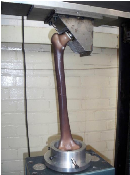
Figure 2. Test set up showing the distal femur secured to the aluminium cylinder by a series of screws. The load was applied to the femoral head by a fixture, which was attached to the actuator of the testing machine.