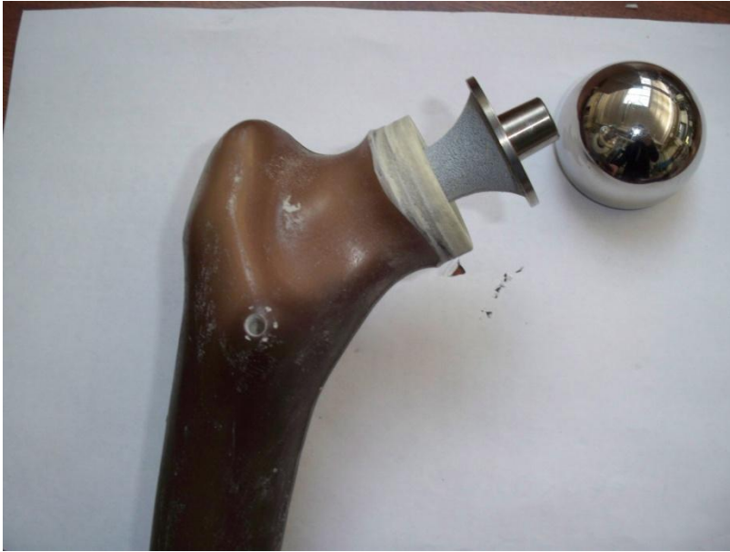
Figure 1. The Birmingham Mid Head Resection (BMHR) prosthesis. The short uncemented titanium alloy stem and a large cobalt chrome molybdenum alloy femoral head can be seen.