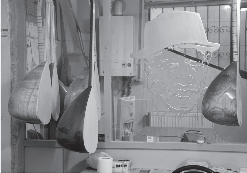
Figure 2. Etching of Aşık Veysel playing a carved saz , in Özkek Uçar's saz atölye .

time-consuming, as mulberry is notoriously tricky to work, its hidden knots making it more prone to cracking than other fruitwoods (Figure 3). Despite the price premium, and a potentially negligible difference in sound quality, Özkek Uçar's workshop still fills many orders for carved sazes. Özkek's atölye is similar to the tanbür workshop of Ustād Asad Allāh described by Hooshmandrad and Fozi; both provide instruments for a steadily increasing worldwide market for sacred instruments, and both continue to use traditional tools and woods.