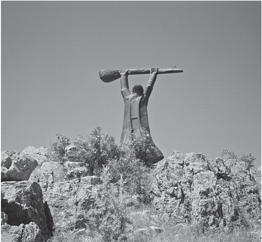
Figure 6. Pir Sultan Abdal and saz .

aşık repertoire, experimental improvisations, and drum solos, and culminated in lively line dance numbers. For example, in their 1984–85 performances of Dadaloğlu’s “Kalktı göç eyledi avşar elleri (yollar bizimdir),” Ali Ekber Aydoğan interrupted the song lyrics “Belimizde kılıcımız kırmanı” (In our mountain pass our swords are broken) with “rifle fire” that he produced sonically, by playing with heavily strumming stopped strings and gesturally mimicking the motions of rifle use with his electrocura. 42