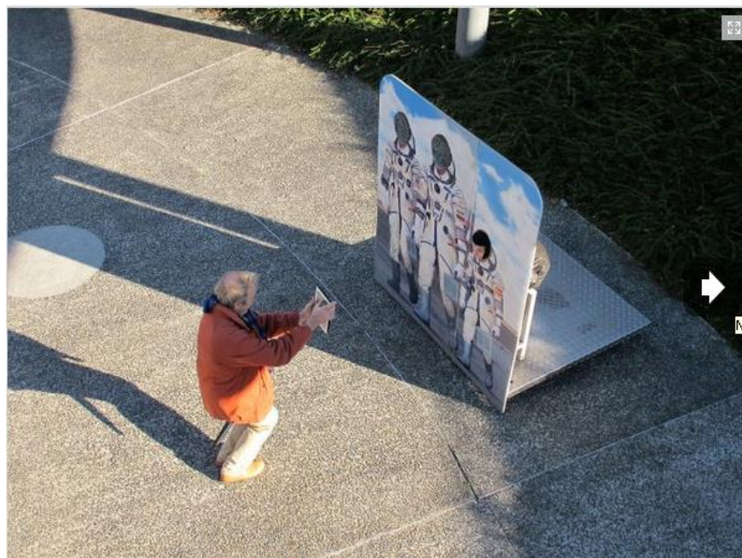
Figure 6: Family photograph before entering the Mir