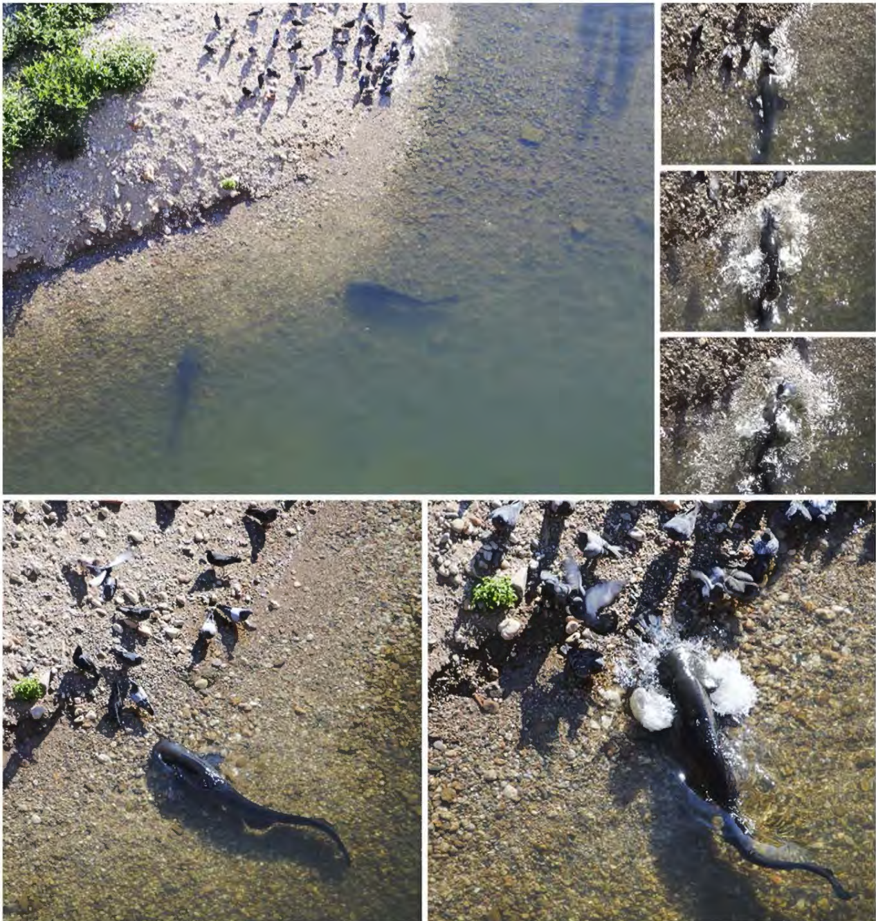
Figure 1. European catfish displaying beaching behavior to capture land birds. Several individuals were observed swimming nearby the gravel beach in shallow waters where pigeons regroup for drinking and cleaning (large picture). One individual is seen approaching land birds and beaching to successfully capture one (small pictures).

gravel island. Throughout the survey, river discharge was low and the water was clear, allowing full observation of all displayed behavior (Figure 1 and Movie S1).