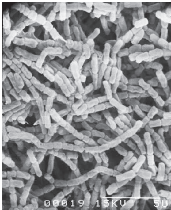
Fig. 1 Scanning electron micrograph of strain H32 T grown on ISP 2 medium containing 15 % (w/v) NaCl for 28 days at 30 °C. Bar 5 µm

Strain H32 T was determined to contain meso -diaminopimelic acid (but not glycine) in its cell wall. Whole-cell hydrolysates were found to contain arabinose and galactose (in addition to ribose), which is typical of cell-wall type IV and whole-cell sugar pattern type A (Lechevalier and Lechevalier 1970). The diagnostic phospholipid detected was phosphatidylcholine, corresponding to phospholipid type PIII (Lechevalier et al. 1977). Diphosphatidylglycerol, phosphatidylglycerol, phosphatidylinositol, two unknown phospholipids and three unknown glycolipids were also detected (Supplementary Fig. S1a, b and c). The predominant menaquinones were determined to be MK-10 (H 4 ) (29.4 %) and MK-9 (H 4 ) (22.4 %) and minor amounts of MK-10 (H 2 ) (9.4 %), MK-11