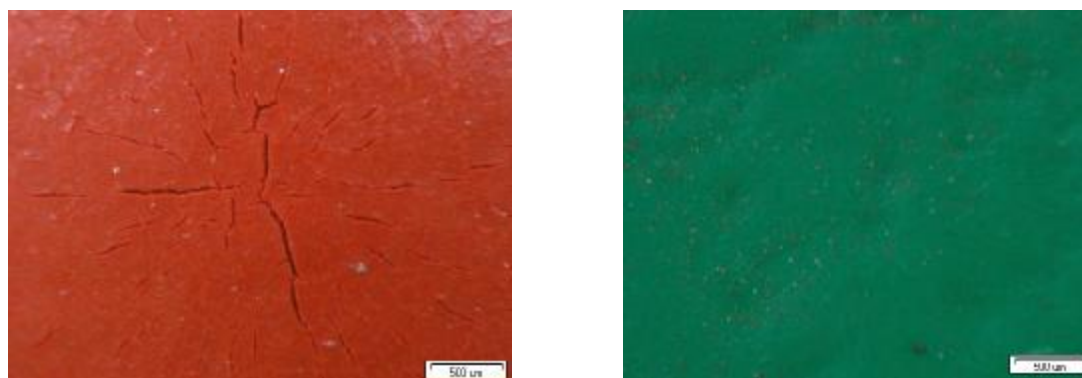
Figure 1: Deformation of tested samples with the cup depth of 5 mm, coating thickness upto 80 µm: Eternal (left) and Colorlak (right)

As it is apparent from Figure 1, anticorrosion system Colorlak performs better elastic characteristics than the Eternal paint system. Table 2 shows values of elasticity of both paint systems before corrosion test.