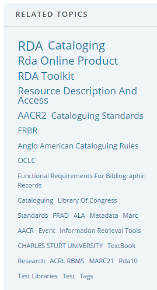
Figure 2 – 'Related Topics' suggested by Wordpress

The methodology outlined in the preceding chapter was largely successful at producing a moderately sized yet broad corpus. The initial search of Wordpress's designated search engine retrieved 48 responses, all of which were considered for this study. As this search engine only retrieved blog posts which had been tagged with the terms 'RDA' or 'Resource description and access' as a user assigned taxonomy, an attempt was made to use the 'related topics' tab supplied by the search engine.