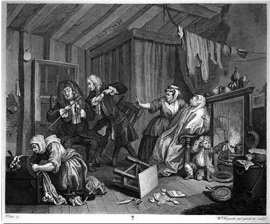
Fig 1 Hogarth, The Harlot's Progress