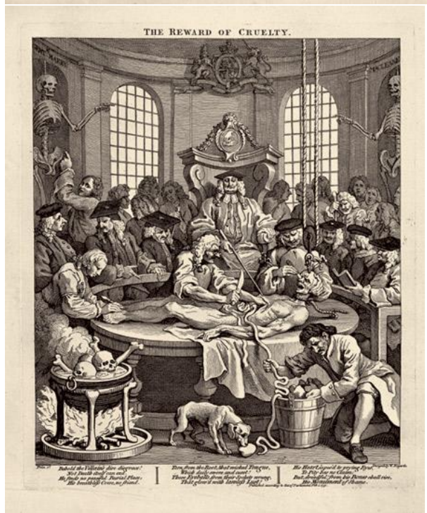
Fig.3 Hogarth, The Four Stages of Cruelty