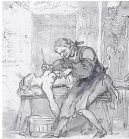
Fig.4 Rowlandson, The Persevering Surgeon