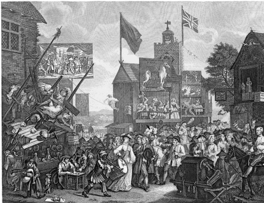
Fig.2 Hogarth, Southwark Fair