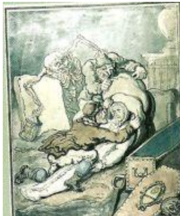
Fig.5 Rowlandson, The Resurrection Men