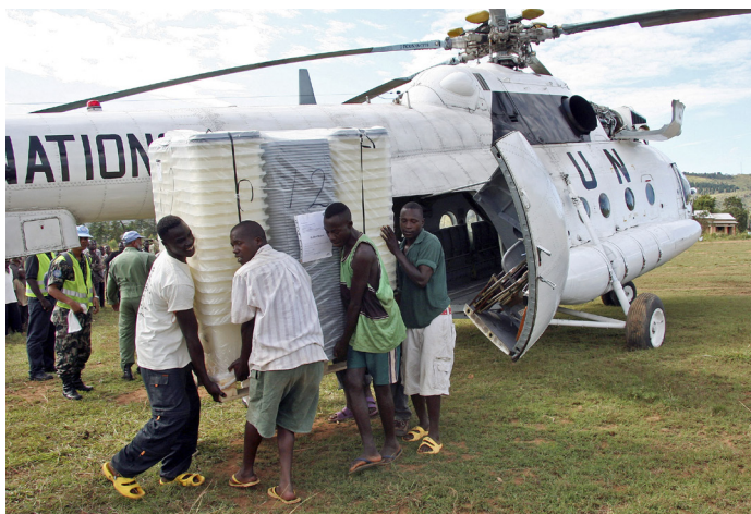
United Nations electoral assistance in Burundi (2005).