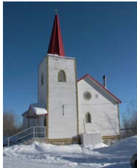
All-Saints Anglican Church

The Mallard fire demonstrated the need for human resources and revised infrastructure as well as physical resources . Human resources including community volunteers and Emergency Social Services as well as paid employees contributed greatly to dealing with the disaster.