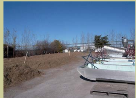
Wild Rice Plant

Having an up-to-date list of contractors with equipment useful in fire management will be helpful. Having signed contracts with these individuals and their companies to access their equipment during disasters will help ensure efficient disaster planning.