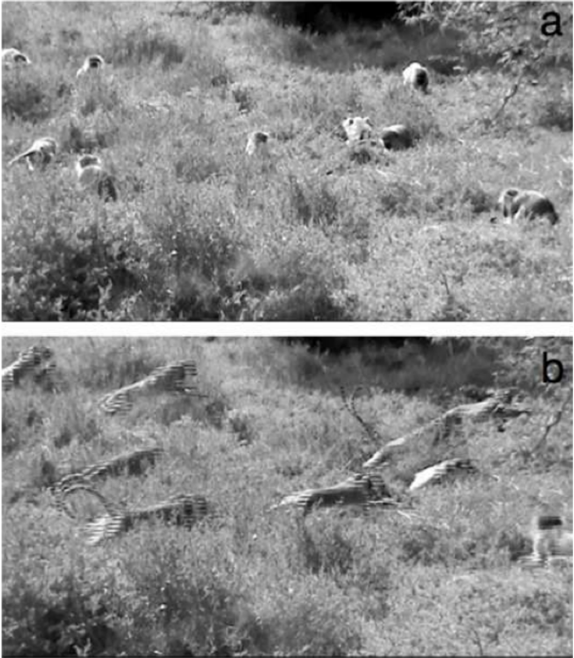
Figure 5.1: A group of nine vervet monkeys (A) at the moment that the call is presented to them from a distance of 29m and (b) 300ms later. Interlacing is visible in B because images were extracted from a digital video recording.