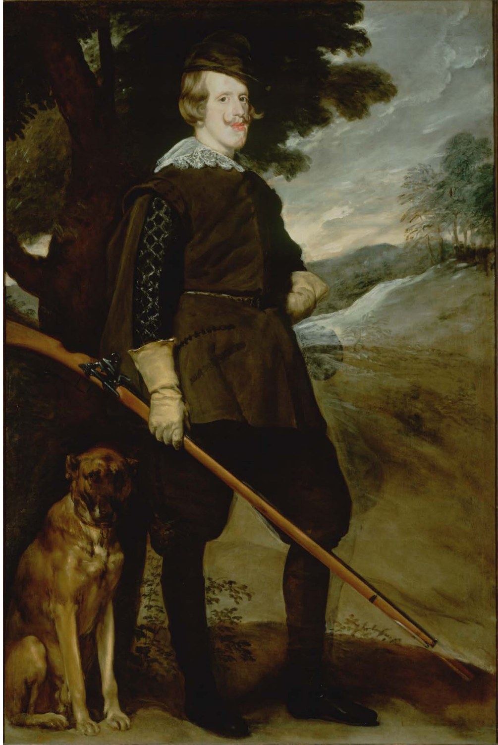
Fig. 4.3: Diego Velázquez, Philip IV as a Hunter, c. 1636-1638. Oil on canvas, 189 x 124.5 cm. Museo Nacional del Prado, Madrid, Spain.