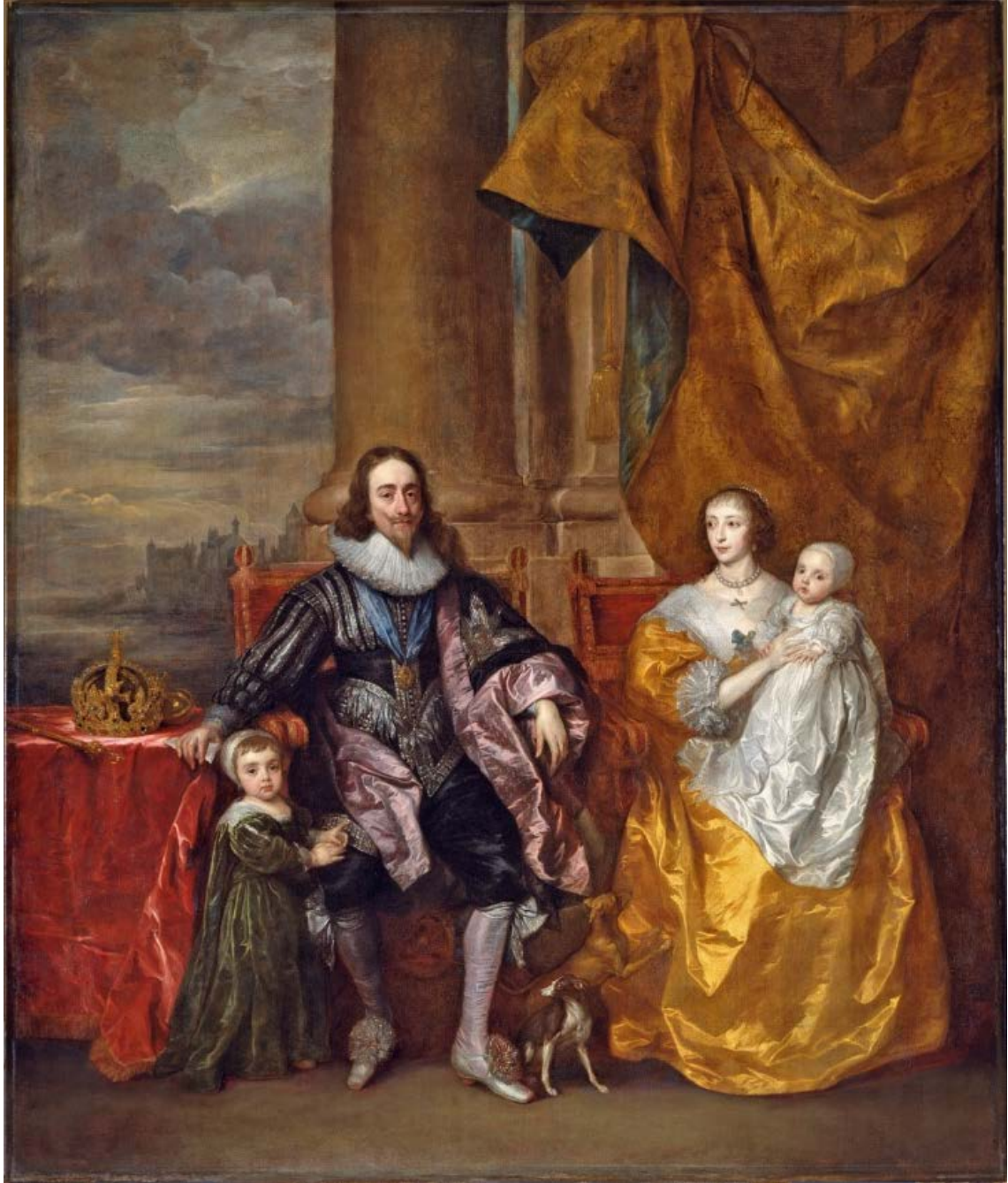
Fig. 2.4: Anthony van Dyck, Charles I, Henrietta Maria and their Two Eldest Children Prince Charles and Princess Mary (The Great Peece, of O r royal self, consort and children), 1632.