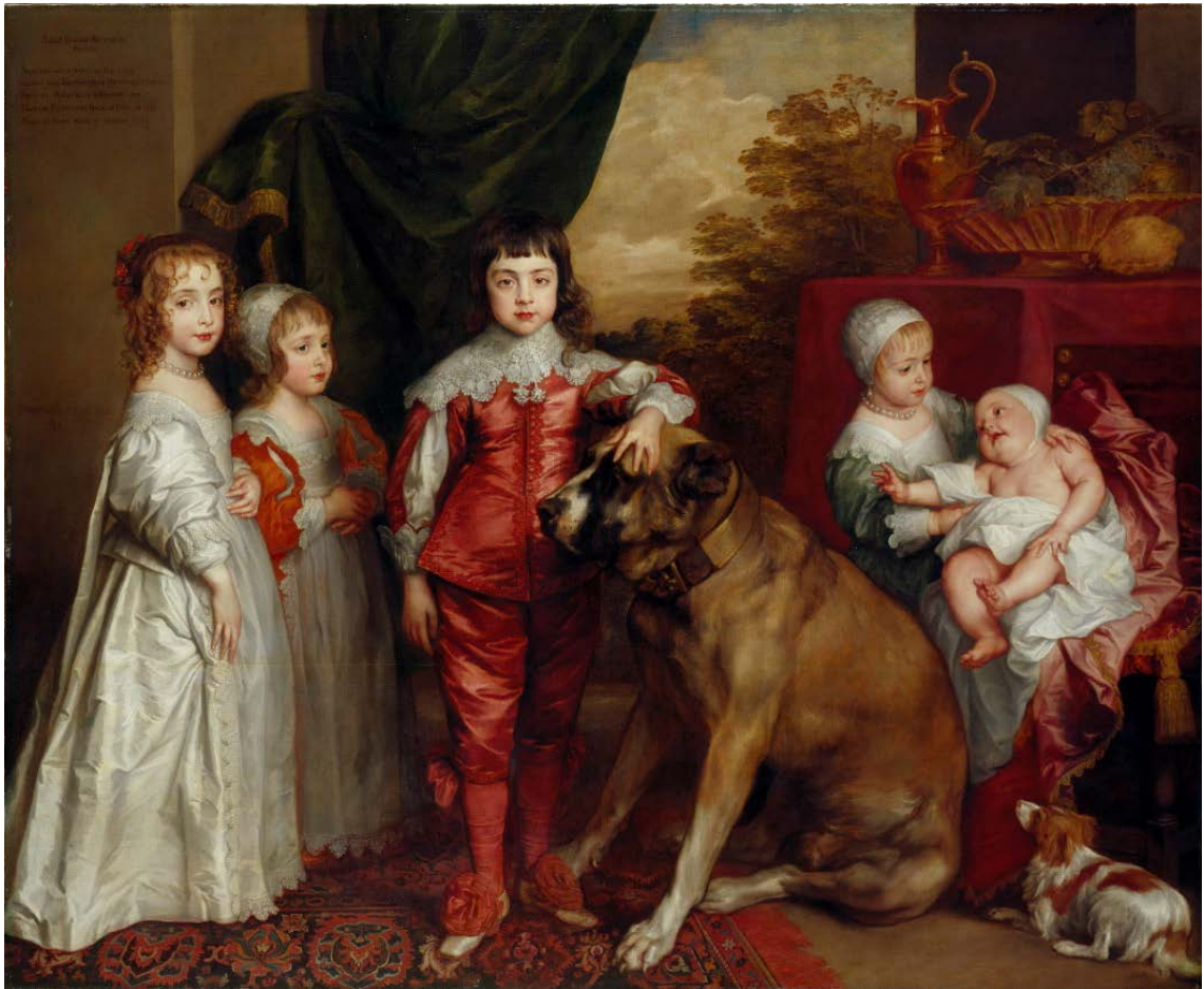
Fig. 2.3: Anthony van Dyck, The Five Eldest Children of Charles I , 1637. Oil on canvas, 163.2 x 198.8 cm.