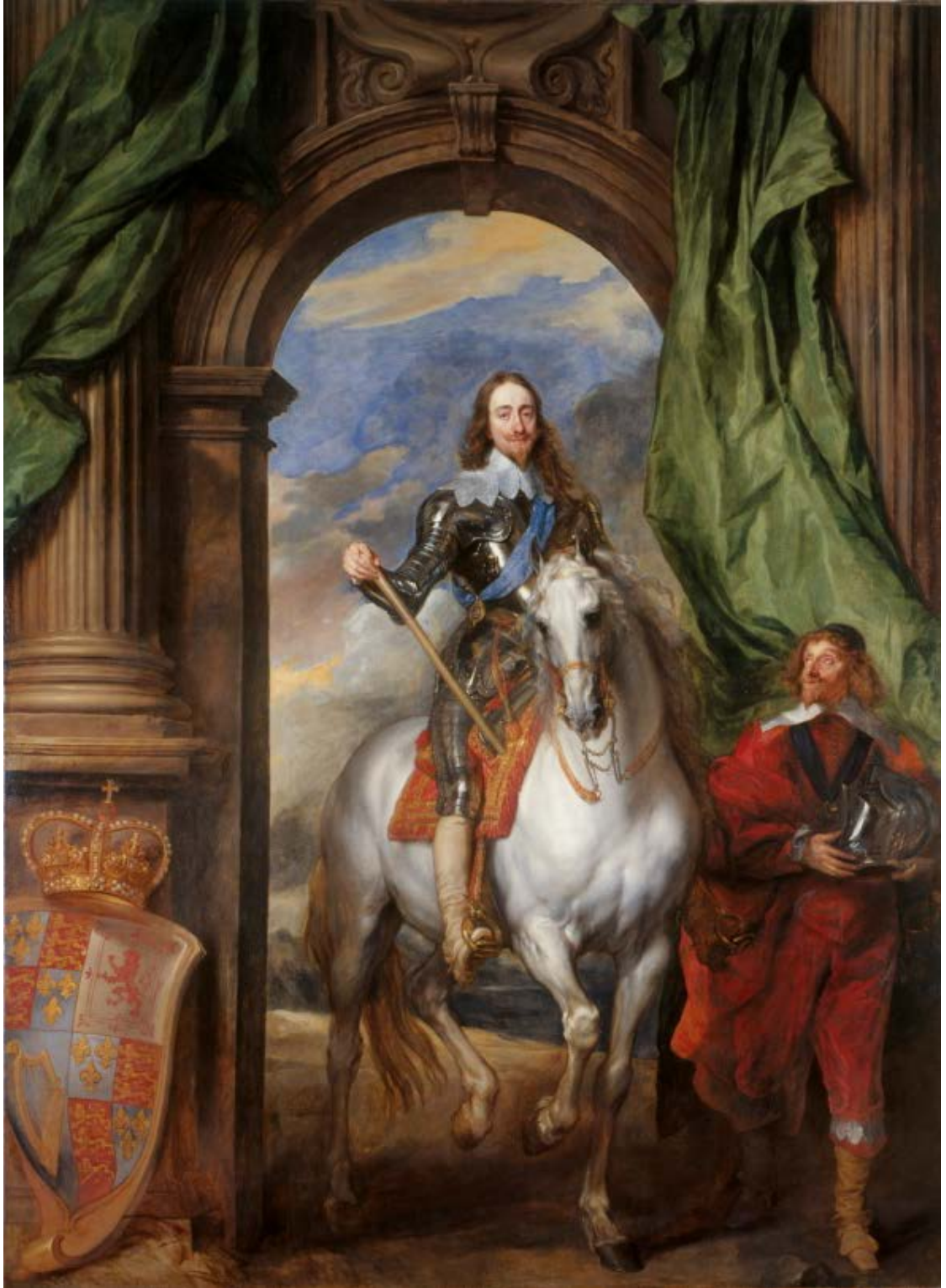
Fig. 3.1: Anthony van Dyck, Charles I on Horseback with Seigneur de St. Antoine , 1633. Oil on canvas, 368.4 x 269.9 cm.