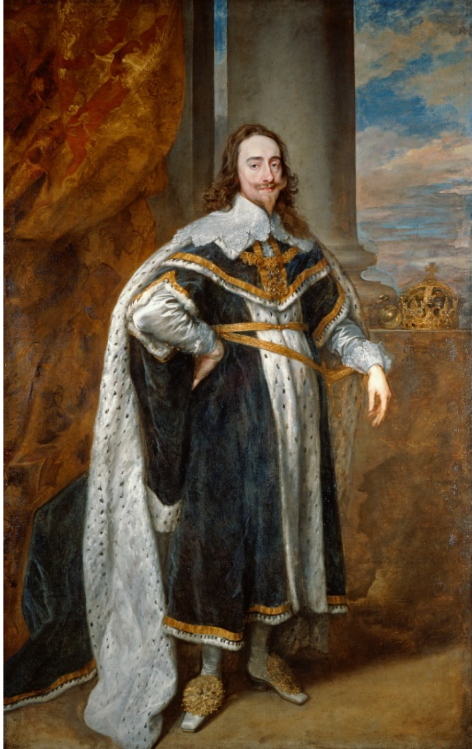
Fig.4.4: Anthony van Dyck, Charles I in Garter Robes , 1636. Oil on canvas, 248.3 x 153.6 cm.