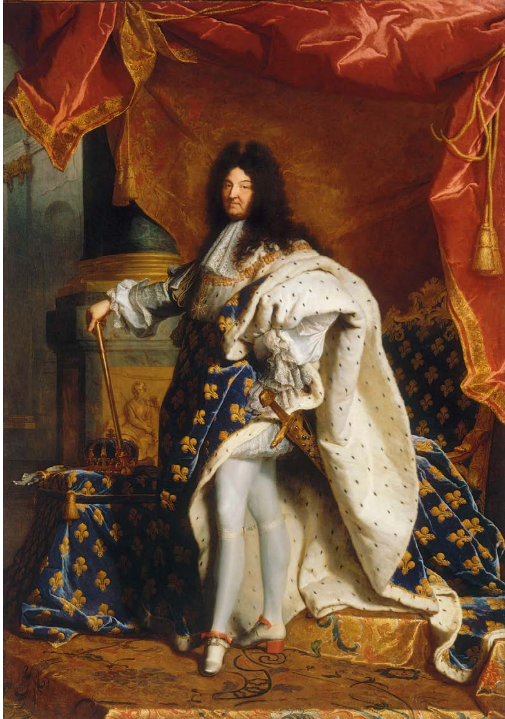
Fig. 4.2: Hyacinthe Rigaud, Louis XIV, King Of France, Full-Length Portrait in Royal Costume 1701.

Oil on canvas, 277 x 194 cm. Musée du Louvre, Paris, France.