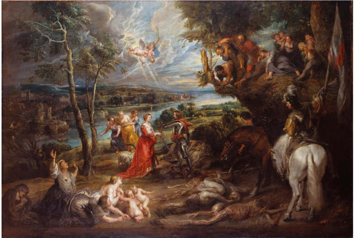
Fig. 3.4: Peter Paul Rubens, Landscape with St. George and the Dragon, c. 1634-1635. Oil on canvas, 152.5 x 226.9 cm.