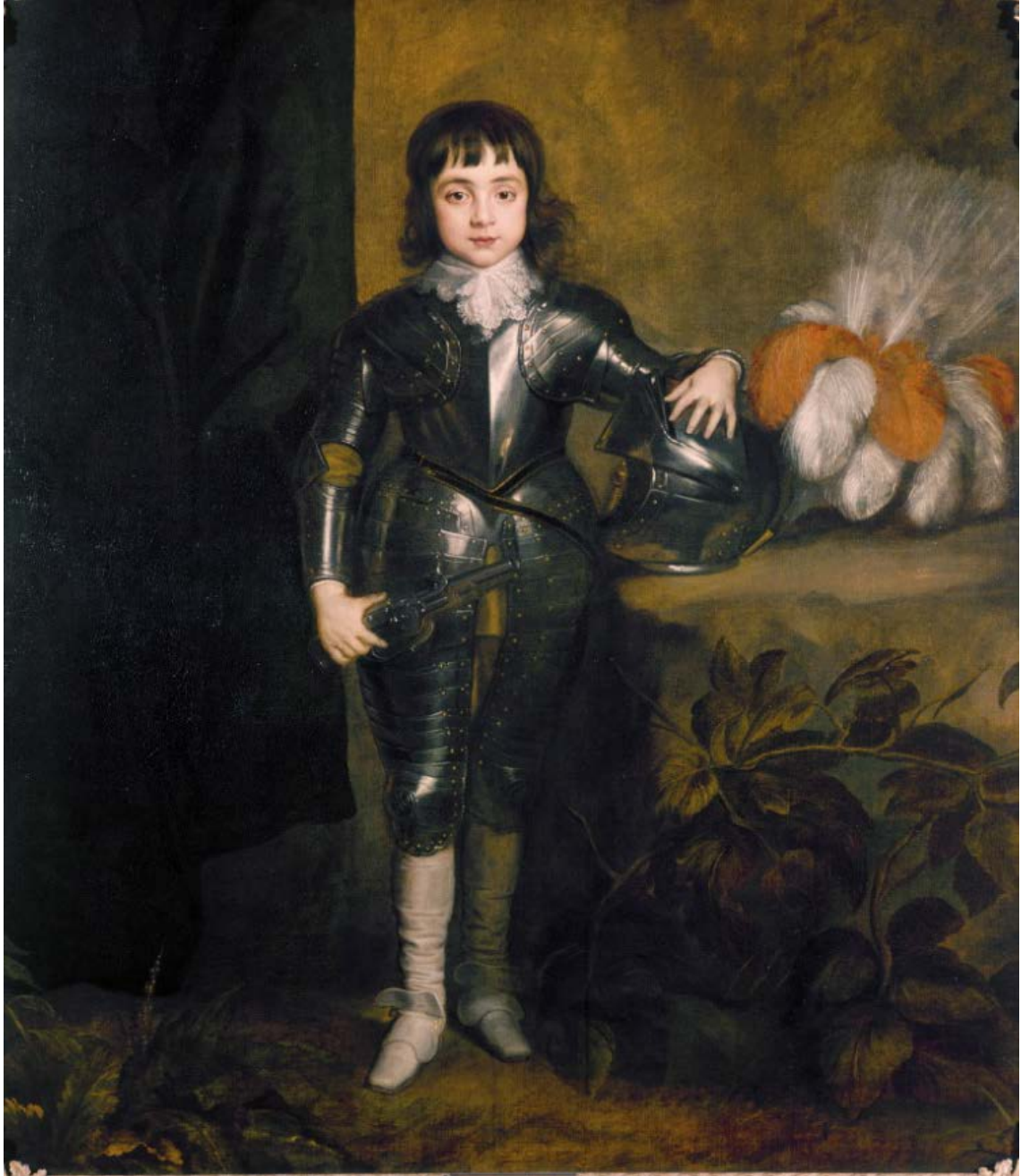
Fig. 3.3: Anthony van Dyck, Charles II as Prince of Wales in Armour, c. 1637-1638. Oil on canvas, 125.7 x 102.9 cm.