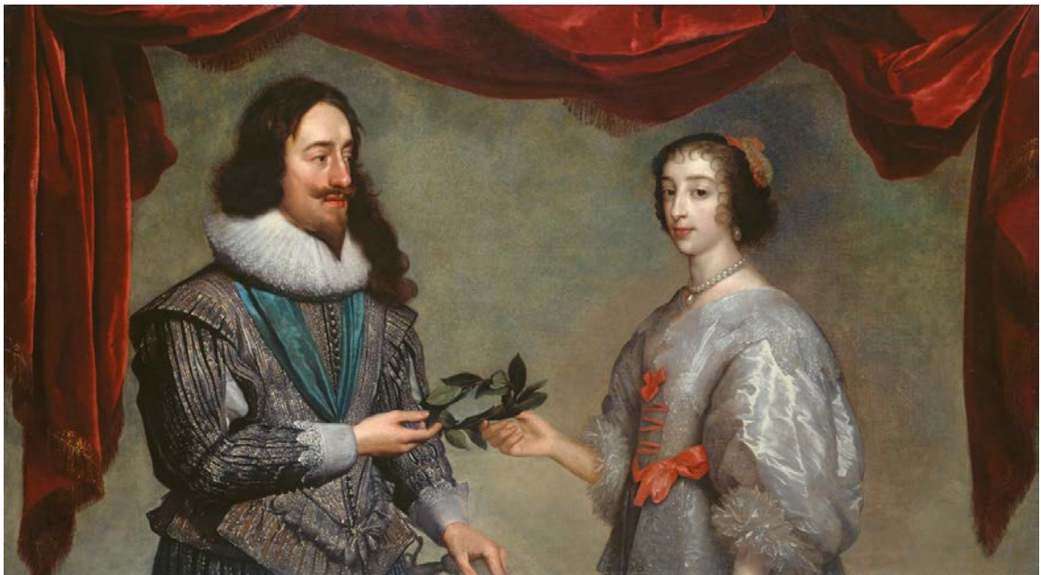
Fig. 2.1: Daniel Mytens, Charles I and Henrietta Maria, c. 1630-1632. Oil on canvas, 95.3 x 175 cm.