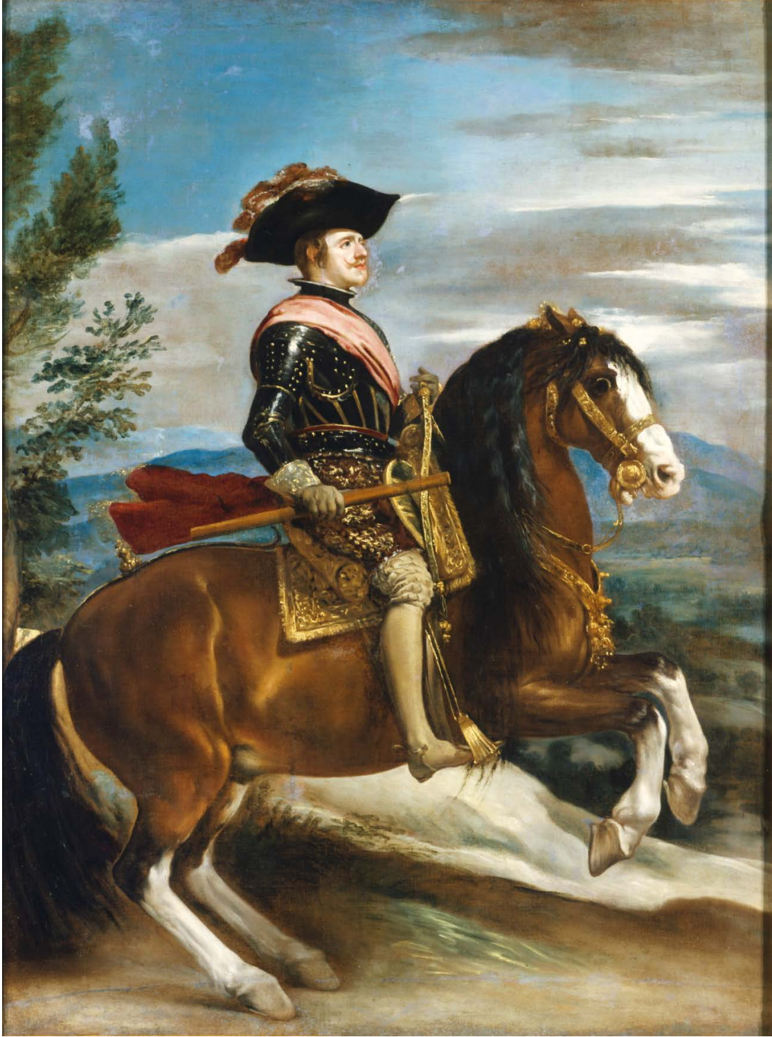
Fig. 3.6: Diego Velázquez, Philip IV on Horseback, c. 1635-1636. Oil on canvas, 303 x 317 cm. Galleria Palatina, Palazzo Pitti, Florence, Italy.