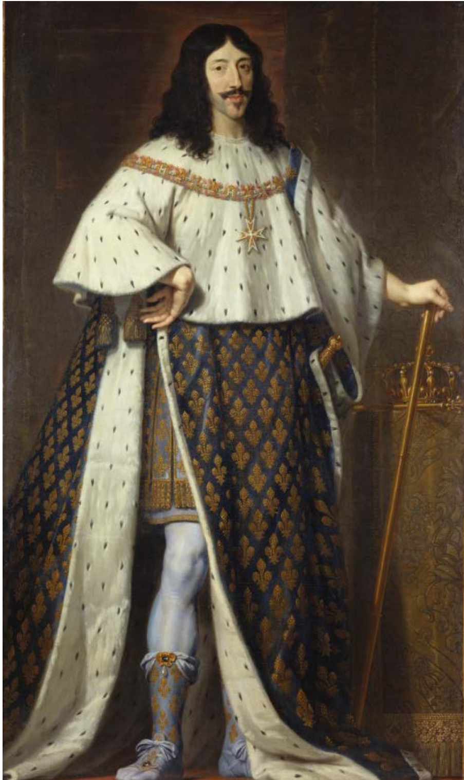
Fig. 4.5: Phillippe de Champaigne, Louis XIII, King of France, c. 1622-1639. Oil on canvas, 194.9 x 114.1 cm.