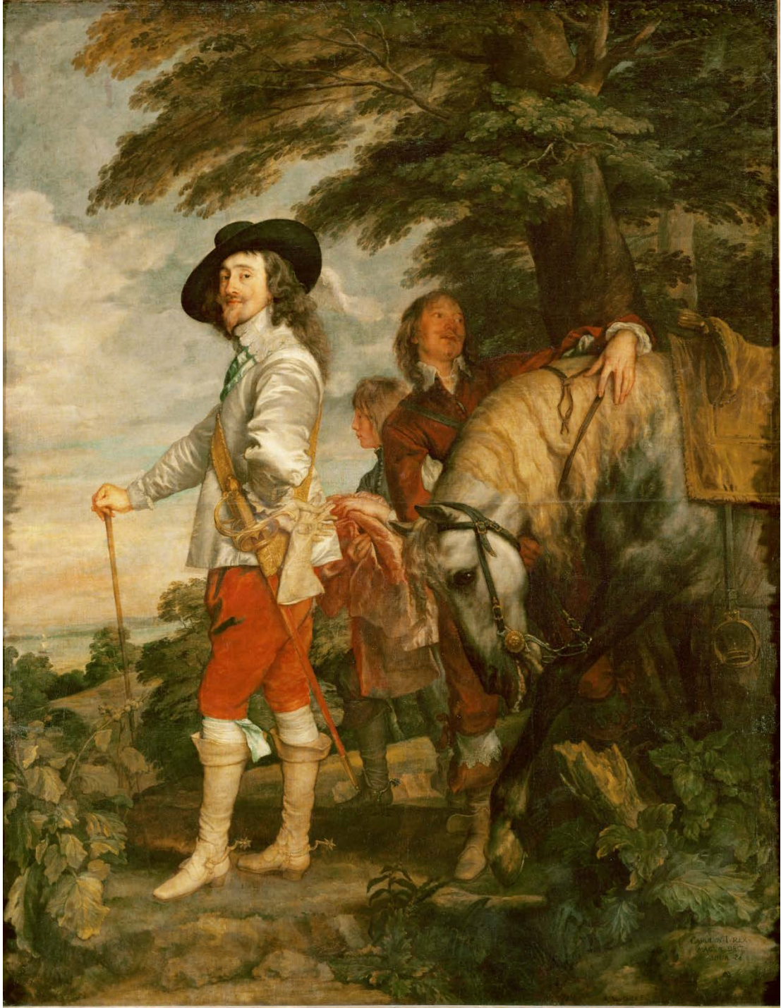
Fig. 4.1: Anthony van Dyck, Charles I in the Hunting Field (Le Roi a la Chasse) , c. 1635. Oil on canvas, 266 x 207 cm. Musée du Louvre, Paris, France.