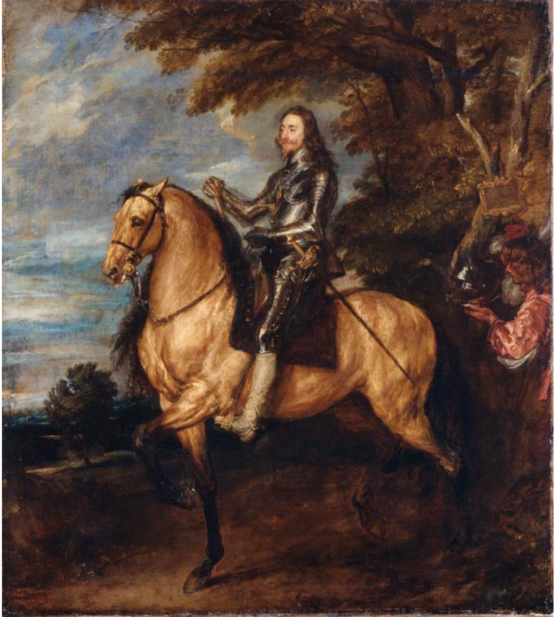
Fig. 3.5: Anthony van Dyck, Charles I on Horseback, c. 1635-1636. Oil on canvas, 367 x 292.1 cm.