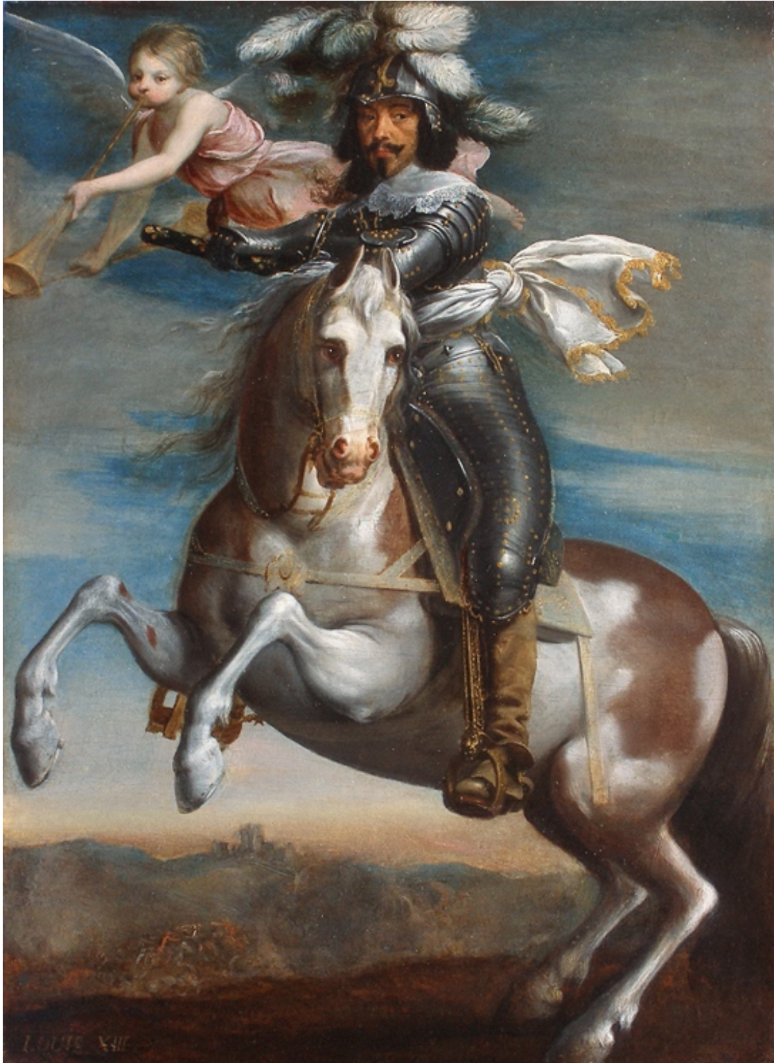
Fig. 3.2: Justus van Egmont, Portrait équestre de Louis XIII , c. 1630. Oil on panel, 41.2 x 29.8 cm.