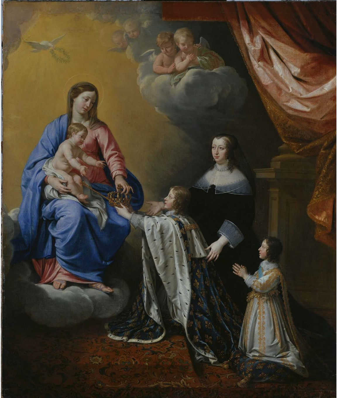
Fig. 2.7: Phillipe de Champaigne, Louis XIV Consecrating Sceptre and Crown to the Mother of God, 1643. Oil on canvas, 118.8 x 100 cm. Hamburger Kunsthalle, Hamburg, Germany. © bpk, Berlin, Hamburger Kunsthalle/Elke Walford/Art Resource, NY.