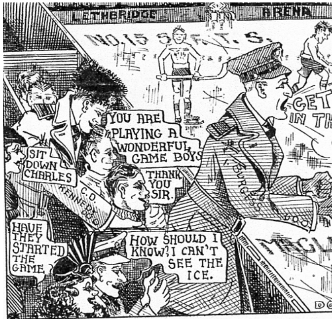
YOU CAN'T KEEP A GOOD MAN DOWN . . . PARTICULAR AT A GOOD HOCKEY GAME