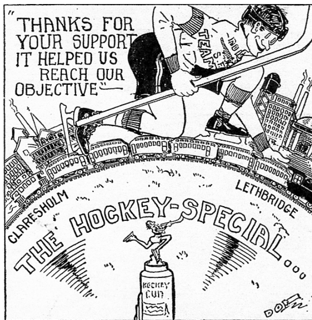
WELL. WE ALMOST REACHED OUR OBJECTIVE!