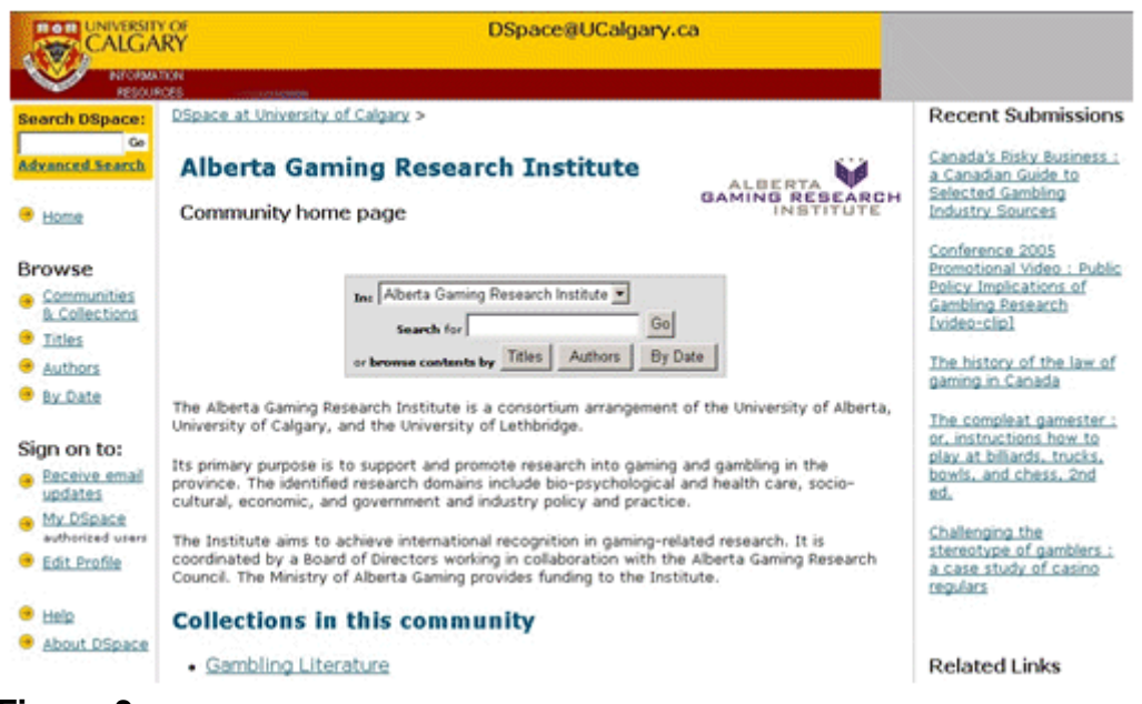
Figure 3 Alberta Gaming Research Institute DSpace Community