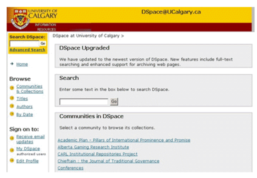
Figure 4 University of Calgary DSpace Home Page