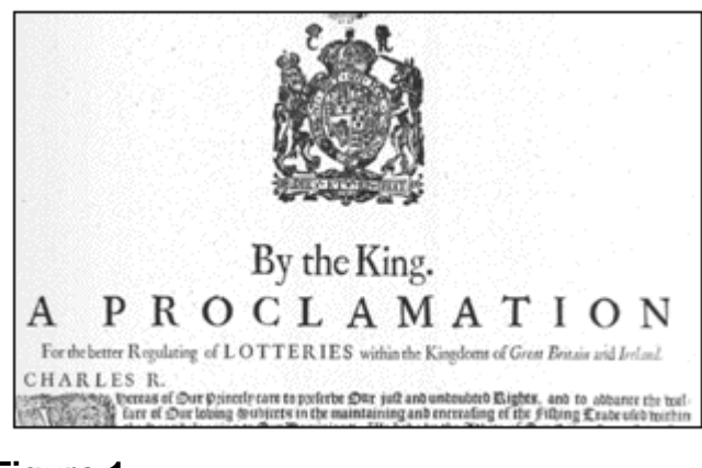
Figure 1 By the King, A Proclamation