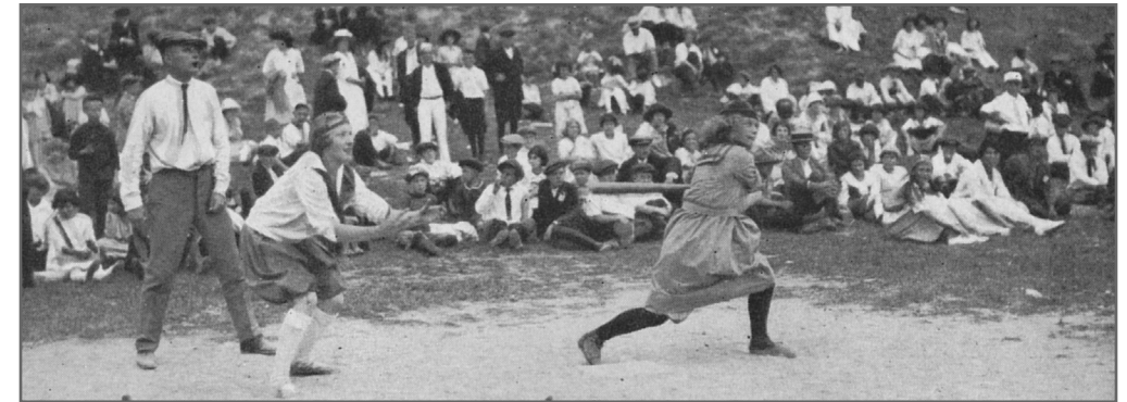
Figure 1: Girls' softball game 1921. Public Utilities Commission, 44th Annual Report (London, Ontario, 1922), 3. 51