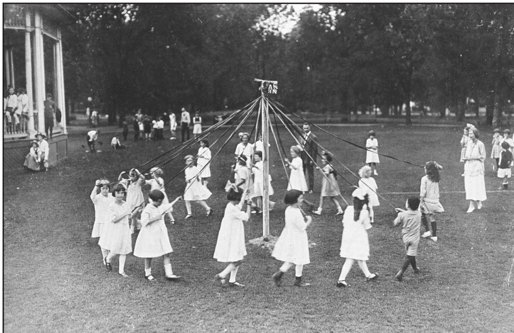
Figure 3: Maypole Dance, circa 1920, PUC Collection, The University of Western Ontario Archives, RC42067.

batt Park. 80 As an alternative source of revenue for the park, the women's league was welcomed as a fruitful replacement to circumvent the effects of the Second World War that led to the diminishment of the men's leagues. The inaugural league consisted of four teams, each one representing a ward of the city: The Shamrocks from the Southeast, The Cardinals from the Northwest, the Eagles in the South, and the Royals in the East. Many of the women interviewed for this study went on to play for one of these city teams.