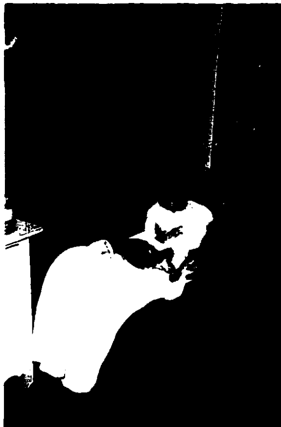
GRAMPA + BETTY JO. OCT.