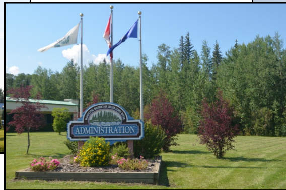
MD of Lesser Slave River No. 124