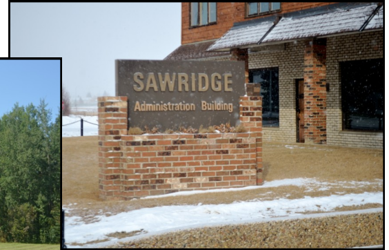
Sawridge First Nation