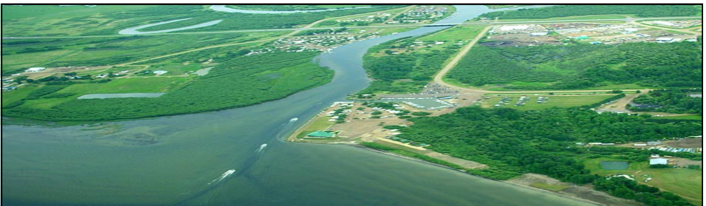
Lesser Slave Lake outlet into Lesser Slave River

This document is based upon the interviews and community fieldwork completed in the Slave Lake region in the first year after the wildfires. The purpose is to share the lessons learned related to the recovery of the community and its citizens. Findings from the school and household survey are available in other reports; see ruralwildfire.ca .