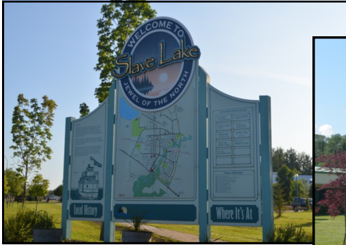
Town of Slave Lake