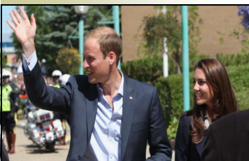
Their Royal Highnesses, The Duke & Duchess of Cambridge

In the Slave Lake area, the three elected councils of the three local authorities worked together during the disaster and recovery of their communities. They worked with the ESRD personnel, local firefighters and other personnel sent in to assist in the fire fighting efforts. Outside consultants were hired to address a multitude of tasks and assist in the recovery efforts.