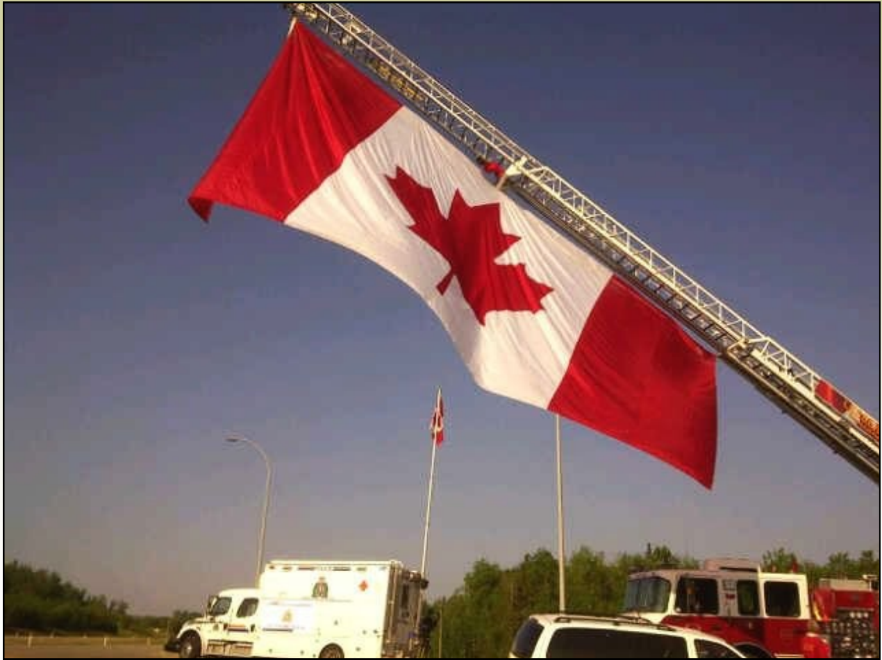
Evacuees returning home May 27, 2011