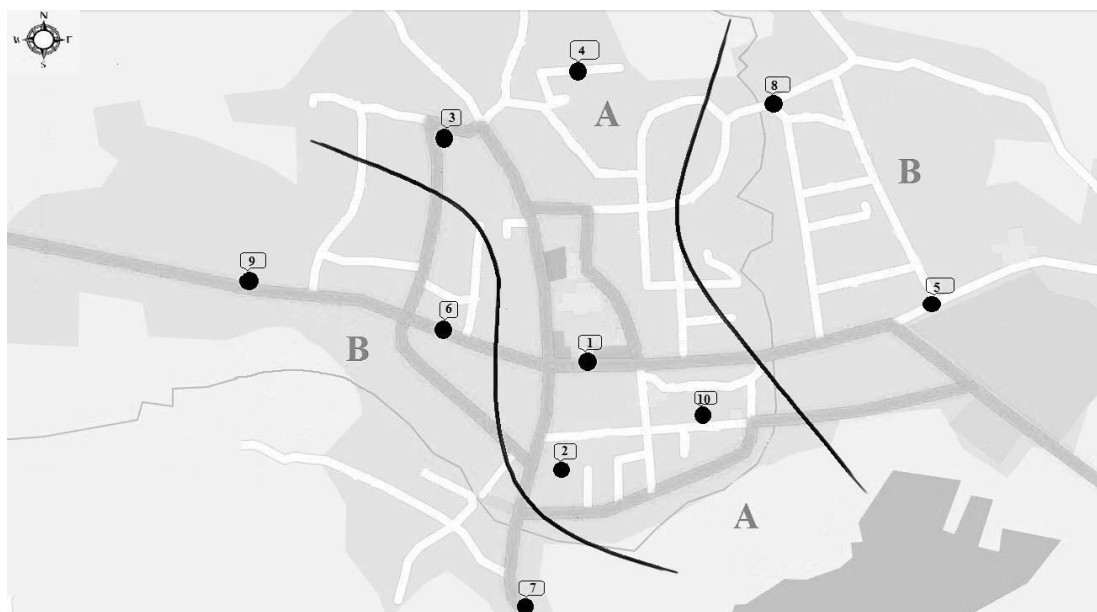
Fig. 2. Investigated spots and zones of different air pollution levels in the city of Blace using lichens as bioindicators. Black dots indicate investigated spots, while the letters A and B indicate lichen desert and struggle zone, respectively.

In 24 points in Blace and the surrounding rural area, 25 lichen taxa from 19 genera were found (Table 3). The most frequent species were Xanthoria parietina (95.8 %), Phaeophyscia orbicularis (83.3 %), Physcia adscendens (83.3 %), Evernia prunastri (75.0 %), Parmelia sulcata (70.8 %), Melanelia subaurifera (66.7 %) and Candelariella xanthostigma (66.7 %). Other taxa have significantly lower frequency.