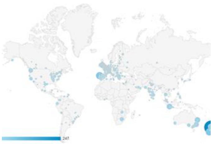
Figure 1: countries where users have downloaded QM from 1/8/2012 to 31/7/2013 (Google Analytics, 2013)

Question Machine was first available at the end of 2010 and has been downloaded approximately 741 times from 1/8/2012 to 31/7/2013 (Fendall, 2013). Google analytics gives a visual idea (figure 1) of the countries where it has been downloaded. QM is currently being evaluated by students who have done a user interface design course.