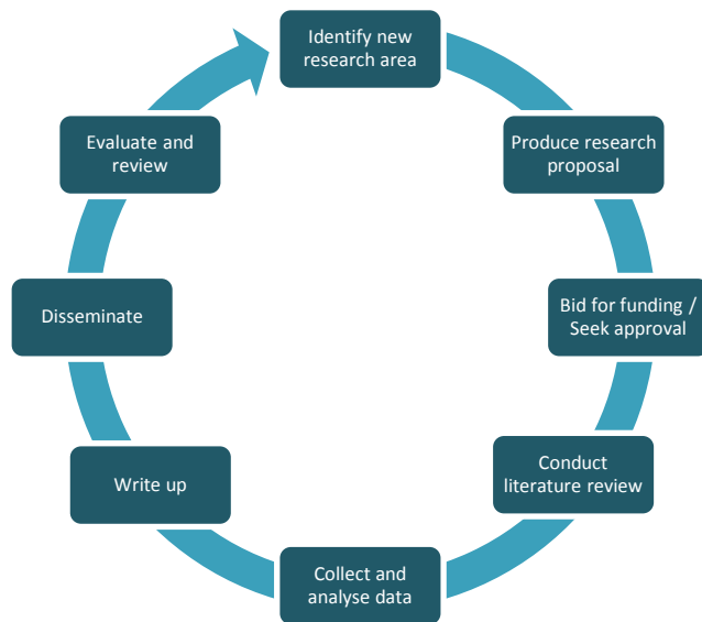
Figure 1: The research lifecycle

Figure 1 describes the research lifecycle. Librarians who support researchers will quickly find that having direct experience of the different steps in this process will enable them to design and implement timely and appropriate support services. For example, having produced a research proposal of their own, the practitioner researcher has a greater understanding of what needs to go into such a document and how the library can support this. Librarians who have themselves sought opportunities for bidding and identified suitable outlets for dissemination are well placed to develop research support services in these areas.