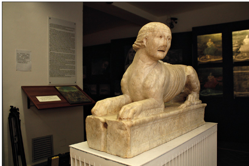
Fig. 1 – Pasquale Romanus Sphinx exhibited in the Museo Civico of Viterbo.

geometry of the areas (Fig. 2). The acquisition process was continuously monitored through a laptop connected to the scanner that was operated using the dedicated software Scan Studio, which can record simultaneously metric data (point clouds) and graphic data (images) due to its sensor and the 3 Megapixel integrated cameras. At the end of each scanning session the RAW data was transferred to another laptop to perform a first alignment in order to check the quality of the acquired data. Using Rapidform XOR 2 , a specific software for reverse-engineering, it was possible to align all the scans afterward obtaining a single points cloud (Fig. 3).