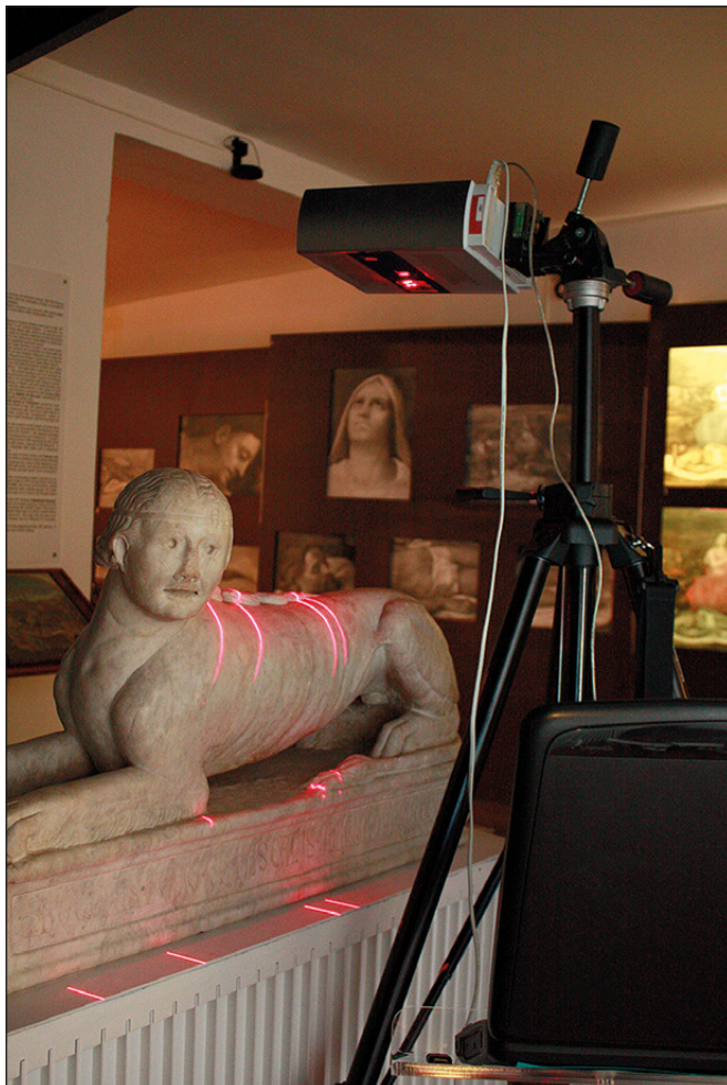
Fig. 2 – The Next Engine scanner during an over-hanged shooting to capture the top of the statue.

The whole acquisition stage lasted 16 hours (two working days). To cover the entire surface of the sphinx 124 scans were needed: 110 of them were taken in wide mode (range: 34.29 \times 25.65 cm) and the other 14 were done in macro mode (range: 12.95 \times 9.65 cm) to produce a high resolution model of the inscription on the base of the statue. The distance between the scanner and the statue ranged from 45-50 cm for the wide mode to 12 cm for the macro mode (Fig. 4). We did not record the entire statue in macro mode because it