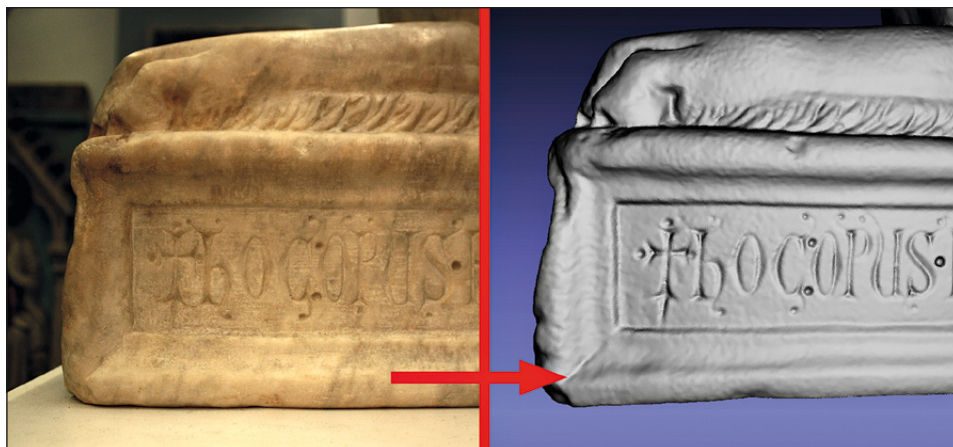
Fig. 4 – Detail showing part of the inscription on the front side and the related 3D geometry (mesh) created by scanning in Macro Mode.