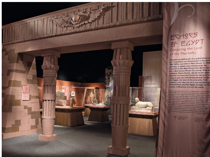
Fig. 7 – The Paschal Romanus sphinx replica finished and displayed into the Echoes of Egypt showcase at the entry of the temporary exhibition area.