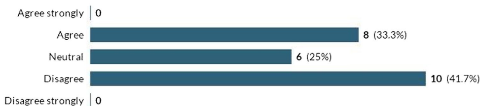
Figure 2. Satisfaction with evaluation funding/commissioning process.

Prompt: "I am satisfied with the process of matching needs and expectations between project evaluation and funders/commissioners".