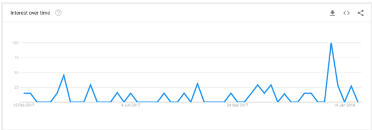
Figure 3 Recycling coffee cups (in the UK)