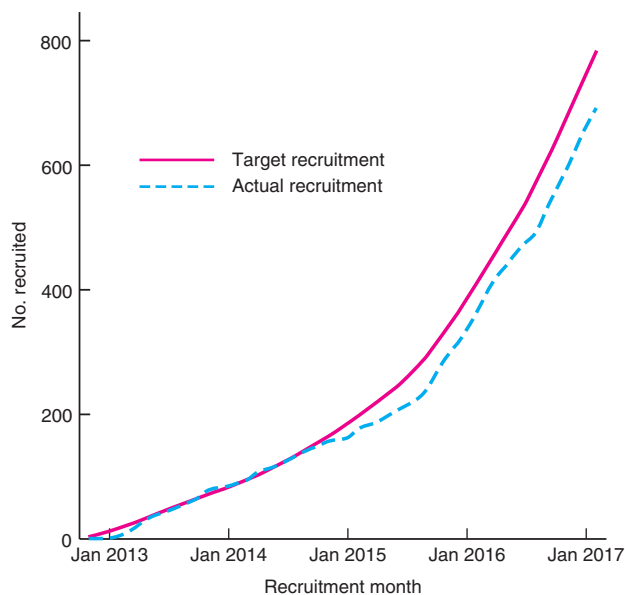
Fig. 2 Recruitment into the By-Band-Sleeve study at January 2017

forward. Each centre needed guidance on: when to collect data using the By-Band data collection forms and when to collect data using the revised By-Band-Sleeve forms; when to start using the revised patient information leaflets; and when the randomization system and database would be switched over and how to manage participants who had given consent but had not been randomized at the time of the switch ( Table 3 ).