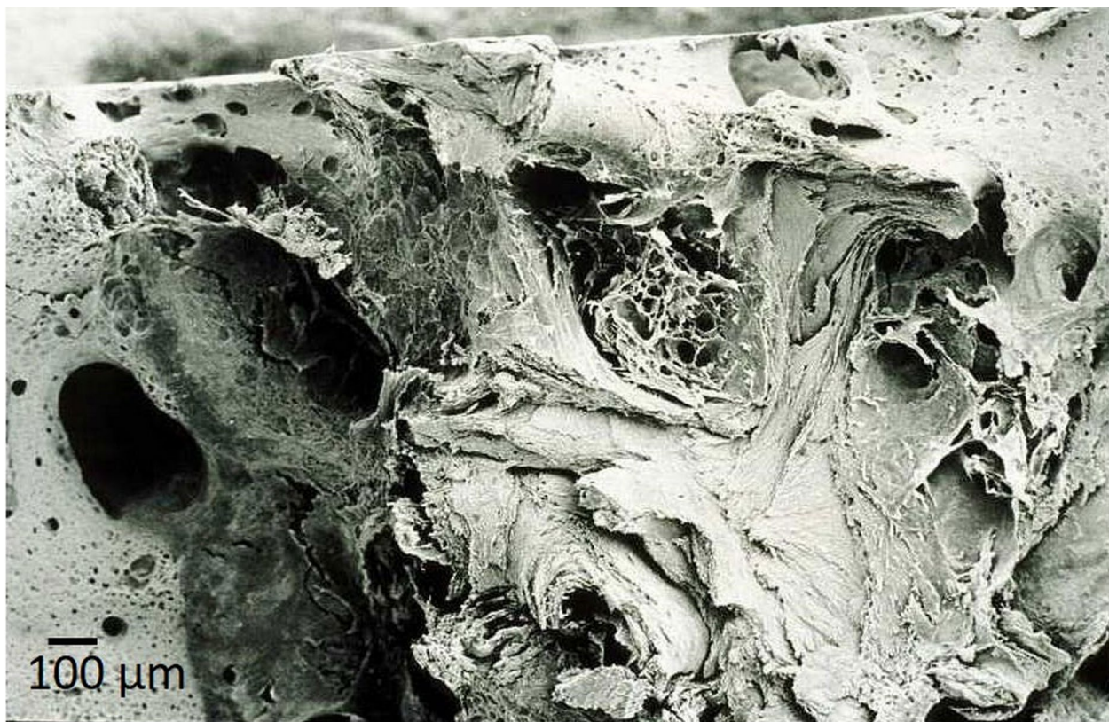
Fig. 1. Scanning electron micrograph of subchondral bone from a 75-year-old patient following total hip replacement for OA. The porous and coarse texture of the bone matrix is apparent, and measurement showed the matrix to be hypomineralised.

Patients with radiographic OA of the hip are reported to have an elevated bone mineral density not only in the hip but also in the distal radius, vertebrae and calcaneus (Nevitt et al. , 1995). Scintigraphy, using technetium 99m, shows increased bone forming activity in joints with pathological signs of OA (Buckland-Wright et al. , 1995). Laboratory studies show alterations in the bone matrix and in osteoblast behaviour. In the hip, an increase in cancellous bone volume of about 60% was found but this was associated with a reduced mineralisation (Li and Aspden, 1997a). Using back-scattered as well as secondary emission electron microscopy, the appearance of the cancellous bone was found to be similar to woven bone seen in fracture repair (Li et al. , 1999) with evidence of osteoclastic resorption in the form of Howship lacunae. In addition, although the subchondral bone plate was thicker, it too was less well mineralised (Li and Aspden, 1997b) (Fig. 1). Increased amounts of bone are reported in the iliac crest of patients with OA of the hand (Gevers et al. , 1989a; Gevers et al. , 1989b), together with greater levels of growth factors (Dequeker et al. , 1997) – supporting the concept that OA may be a part of a generalised disorder. Among the anabolic factors identified as important in bone formation