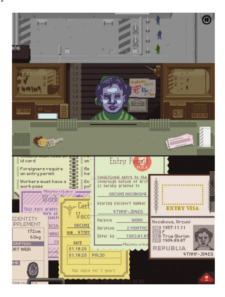
Figure 1. Checking papers late in the game with many rules and documents.

The core mechanics of the game revolve around checking the various details on the paperwork of a succession of travellers trying to gain entry to Arstotzka via the Inspector's booth. The player's agency is almost exclusively limited to choosing whether to admit, deny or (later) detain these travellers. Unlike in a story-driven game, the player cannot make dialogue choices or otherwise interact meaningfully with the characters encountered.