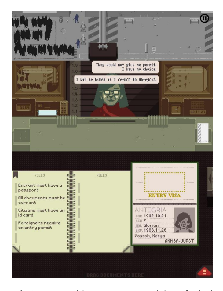
Figure 3. A woman without an entry permit begs for leniency.

However, other elements of the game challenge these dehumanising pressures. For example, the game uses interface mechanics — movement, contrasting colours and sound prompts — which are usually used to highlight important information, to distract the player from the documents, which are difficult to read, towards the conversations with travellers. These conversations, while repetitive, often contain morally compelling scenarios and themes (Figure 3). One tells the story of a man coming to Arstotzka for life-saving surgery unavailable in his home country, and who will die if he isn't admitted. Another involves a joyful husband who is happy to finally be free of