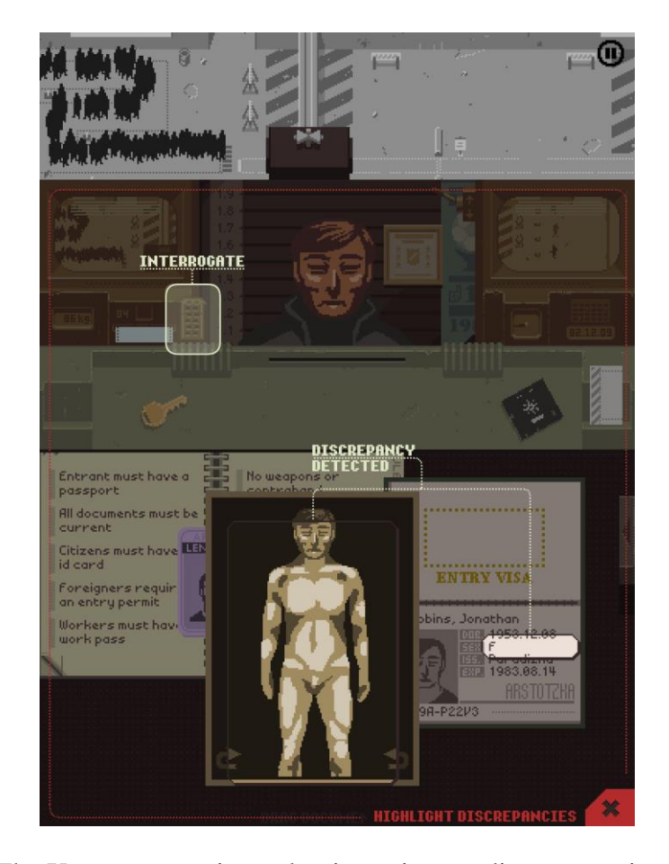
Figure 4. The X-ray scanner is used to investigate a discrepancy in sex/gender.

Although the scanner is initially justified as a device to stop terrorists, it is soon put to other uses, raising questions about the creeping expansion of security powers. For example, one traveller is an Arstotzkan female (according to the "sex" on her passport) with masculine facial features. If the discrepancy between her image and her passport is interrogated, the option to use the scanner appears. Under interrogation the traveller affirms that her passport is correct, but the scanner reveals that she seems to have male genitals (Figure 4). This is treated as a discrepancy by the game and the player will be penalised if they do not refuse her entry. Whenever the facial features of travellers don't conform to gender stereotypes about what a man or a woman should