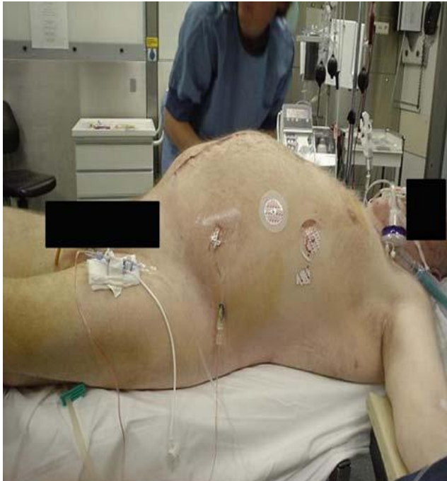
Figure 2. Set-up for measuring intra-abdominal pressure using the Kron method.

Figure 1. Continuous direct intra-abdominal pressure set-up: a central venous catheter was placed through the abdominal wall in the anterior axillary line \pm 5 cm cranial of the iliac crest, and connected to a pressure transducer.