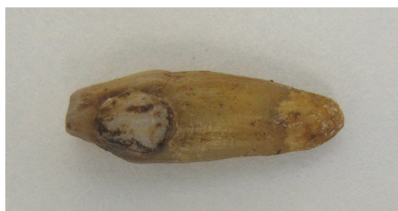
Figure 1 The photograph of the analysed tooth of General Władysław Sikorski (World War II).

Samples S25 and S26 came from two skeletons revealed during conservation work conducted in the Church of St. Andrew in Kraków in 2011. The church of St. Andrew was built between 1079 and 1098, and represents a great example of the Romanesque style. Two medieval skeletons were found under the floor between the chancel and the nave of the church. Based on historical markers the grave was dated to originate from the 14th century. Further anthropological examinations indicated that the S25 male died at the approximate age of 60, whereas the S26 male was approximately 75 years old at the time of death. It is alleged that the skeletons belong to members of the Tęczyński family, representing noble Polish magnates of medieval times. The tooth collected from the deeper burial (S25) was found to be seriously affected by decay, which was reflected by a very low DNA concentration (3 pg/μl) and incomplete autosomal and Y chromosome STR profiles (NGM and Yfiler). Complete mtDNA HVI and HVII profiles were generated in both teeth (data not shown). From these data it was possible to conclude that both skeletons are of male origin and are unrelated in both maternal and paternal lines. From the partial HirisPlex profile