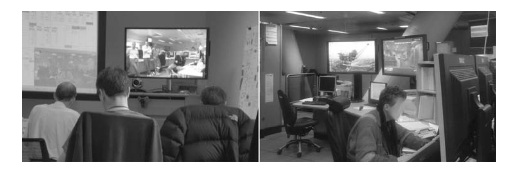
Figure 2. Use of the video-link in the onshore office during a meeting with offshore ( left ) and video-screens from the central control room into the office ( right ).

According to Clark and Brennan (1991), capabilities of media can be described with respect to eight characteristics that determine the nature of communication: copresence (group members occupy the same physical location), visibility (group members can see one another), audibility (group members can hear one another), cotemporality (communication is received at the approximate time it is sent),