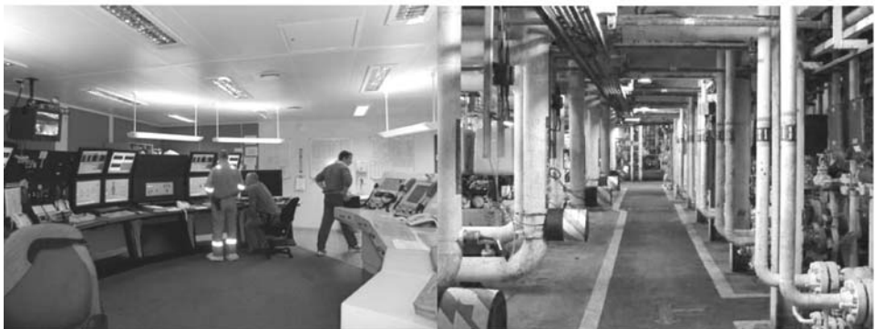
Figure 1. Typical work environments onshore and offshore. Top two pictures: team areas in the onshore office; bottom left: view of the main console in a central control room offshore; bottom right: part of the production area on an oil platform.