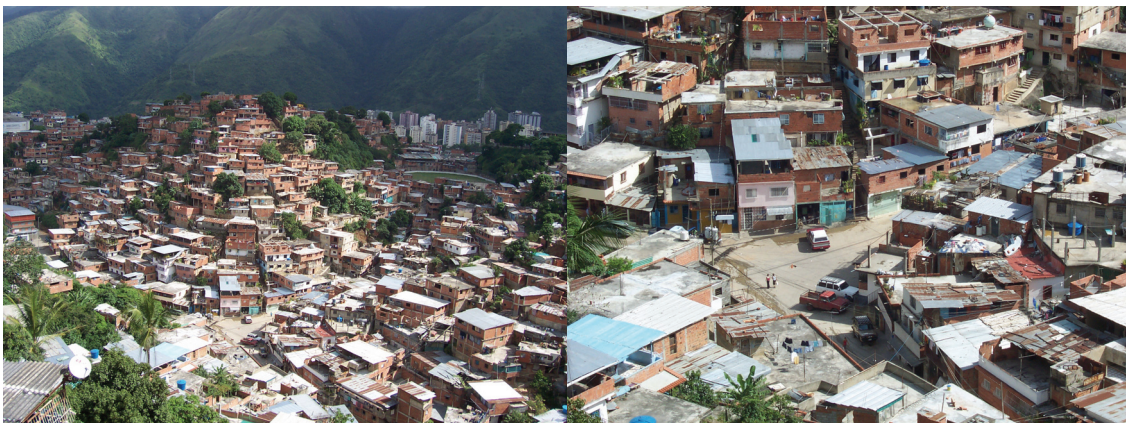
Figure 1: Barrio agglomeration east of Caracas in Petare Norte

Unregulated and rapid urbanisation in Venezuela like elsewhere in the developing world, has led to mushrooming of informal settlements called barrios which are built by the inhabitants themselves outside the formal urban regulatory framework. Barrios are characterised by precarious housing, poor basic services, low quality of living conditions, spatial segregation, and social exclusion. Barrios are the spatial translation of urban poverty. All these characteristics underline the need for integrating barrio communities to the urban dynamics of the mainstream city, in order to create a more inclusive city and a society at large. It is estimated that in the metropolitan area of Caracas alone, there are 317 barrios forming 14 barrio agglomerations distributed across the city, occupying 3,446 ha and accommodating around 1,002,780 poor (Villanueva and Baldó 1995) (See Figure 1).