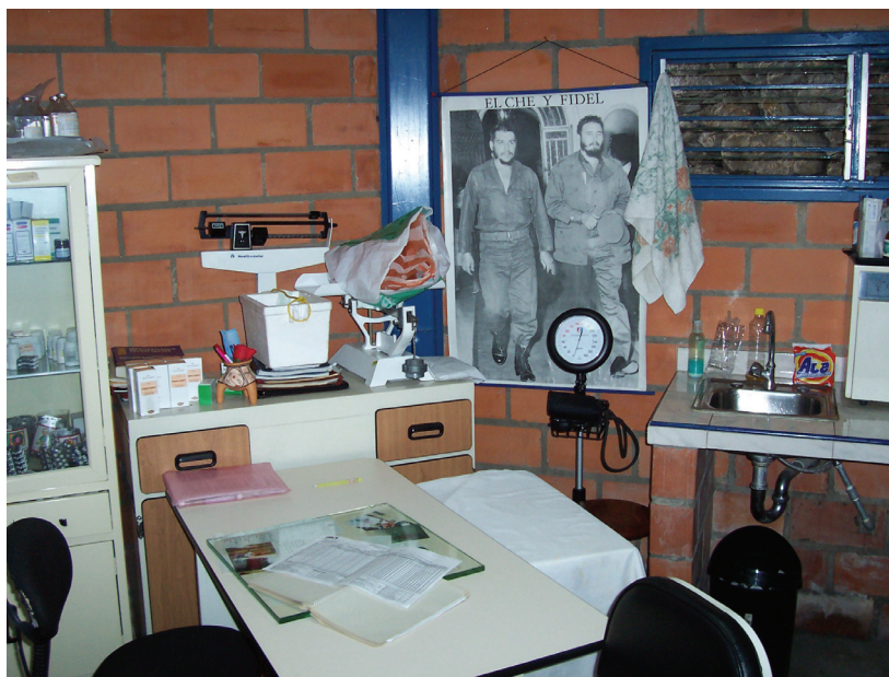
Figure 3: Primary health care module of Mision Barrio Adentro