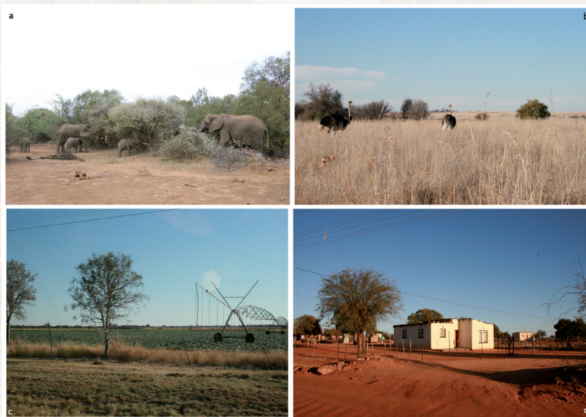
Typical land cover types of the the study area: (a) woody vegetation; (b) grassland; (c) cropland, and (d) non-vegetated land.

This affects many areas across the world, with more than 50 percent of the Earth's land surface thought to be prone to LDD, which can be broadly defined as the inability of the land to provide those services that it would have been able to provide previously, due to a combination of anthropogenic processes. A number of reasons have been put forward to explain the growing severity of the LDD problem, yet Dr Symeonakis says the primary factor is widely thought to be climate change. "A lot of blame was previously put on the management of the area by the local community and the herdsmen, so it was thought to be related to issues like overgrazing, fires and bad management practices, generally. Nowadays we are confident that climate change is the most important factor," he outlines. There is now a concerted focus in research on understanding the extent of the problem, an issue that lies at the core of the project's work. "We're looking at the problem of bush encroachment specifically," says Dr Symeonakis.