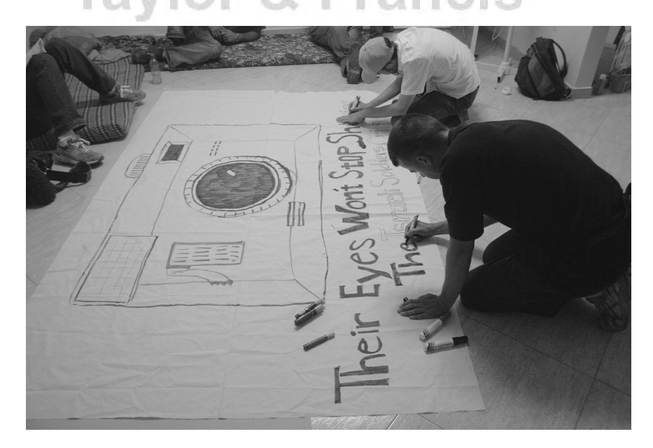
Figure 7.1 photograph of demonstrators creating a banner, Bil'in, West Bank, 9 June 2006.

On 9 June 2006, activists in the Palestinian village of Bil'in, which is near Ramallah in the occupied West Bank, created a hand-drawn banner that included a depiction of a camera for one of their weekly demonstrations against the construction of a section of the West Bank Barrier on village land. A photograph (Figure 7.1) by the Israeli activist photographer Oren Ziv shows the making of this banner on the day of the demonstration.<sup>1</sup>