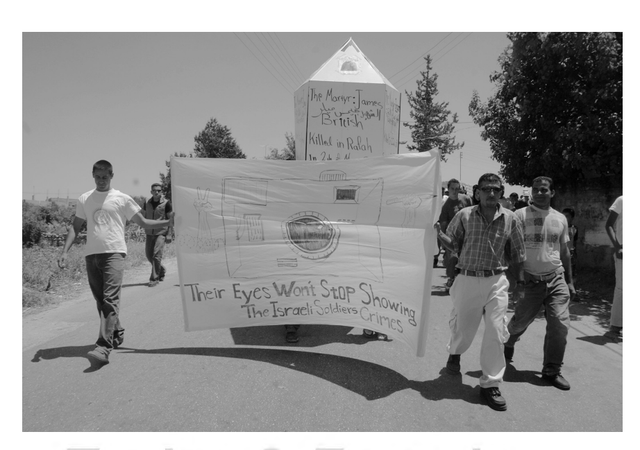
Figure 7.2 Oren Ziv/Activestills, photograph of demonstrators carrying a banner and mock martyrs' memorial, Bil'in, West Bank, 9 June 2006.