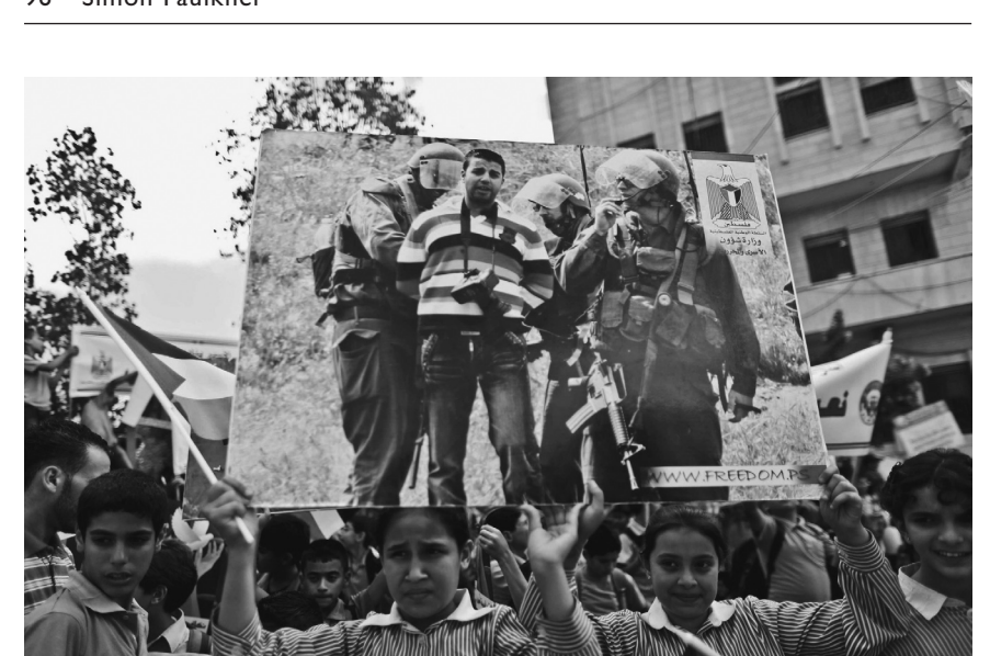
Figure 7.3 Amar Awad, photograph of Palestinian children taking part in a demonstration against restrictions on press freedom in Ramallah in the West Bank in 2012. The children carry a large photograph of Israeli soldiers detaining the photojournalist Amar Awad at a demonstration in Bil'in in 2007. Used as a Facebook banner by Amar Awad.