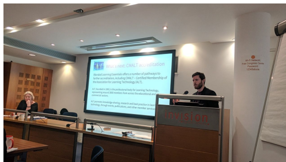
Images from TUC workshop, 7 Dec 2017