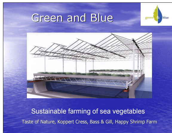
Figure 3 Sustainable farming of shrimps and cress (see online version for colours)

During the building of the shrimp farm, the directors started a joint-venture with another company for also growing sea vegetables in the farm, combining the shrimp breeding batch with the growth of cress on the top of the water basins, profiting from the temperature and the humidity within HSF (see Figure 3). In 2008, they started an experiment with growing orchids at a top layer in the greenhouse.