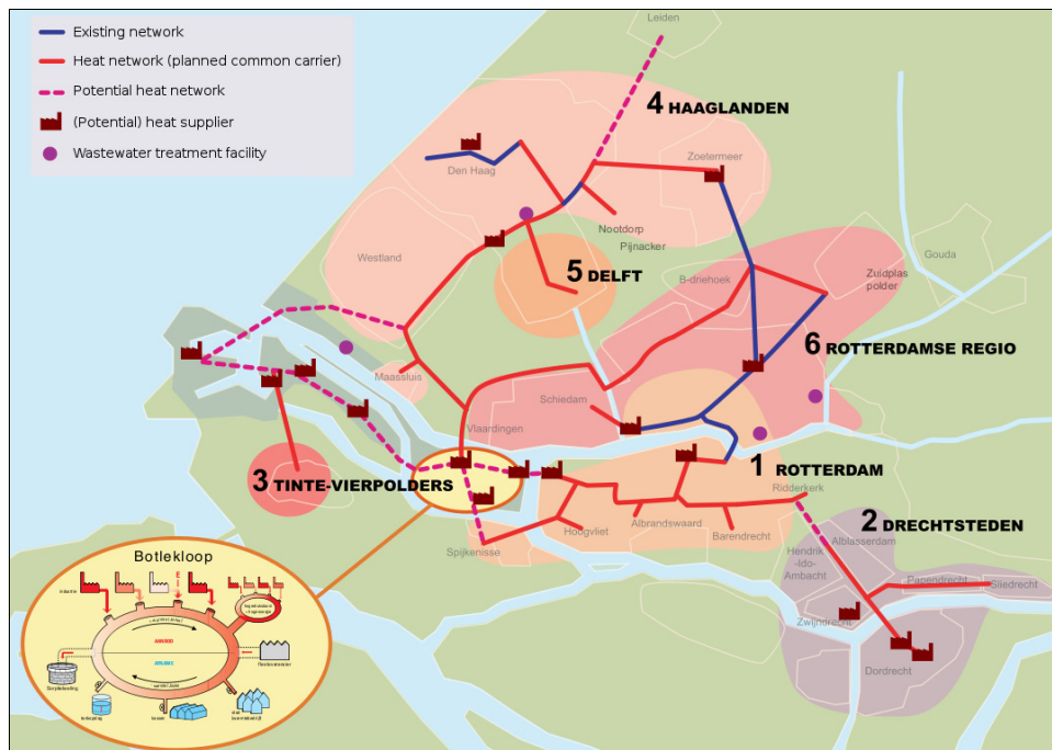
Figure 2 R3 waste heat infrastructure (see online version for colours)