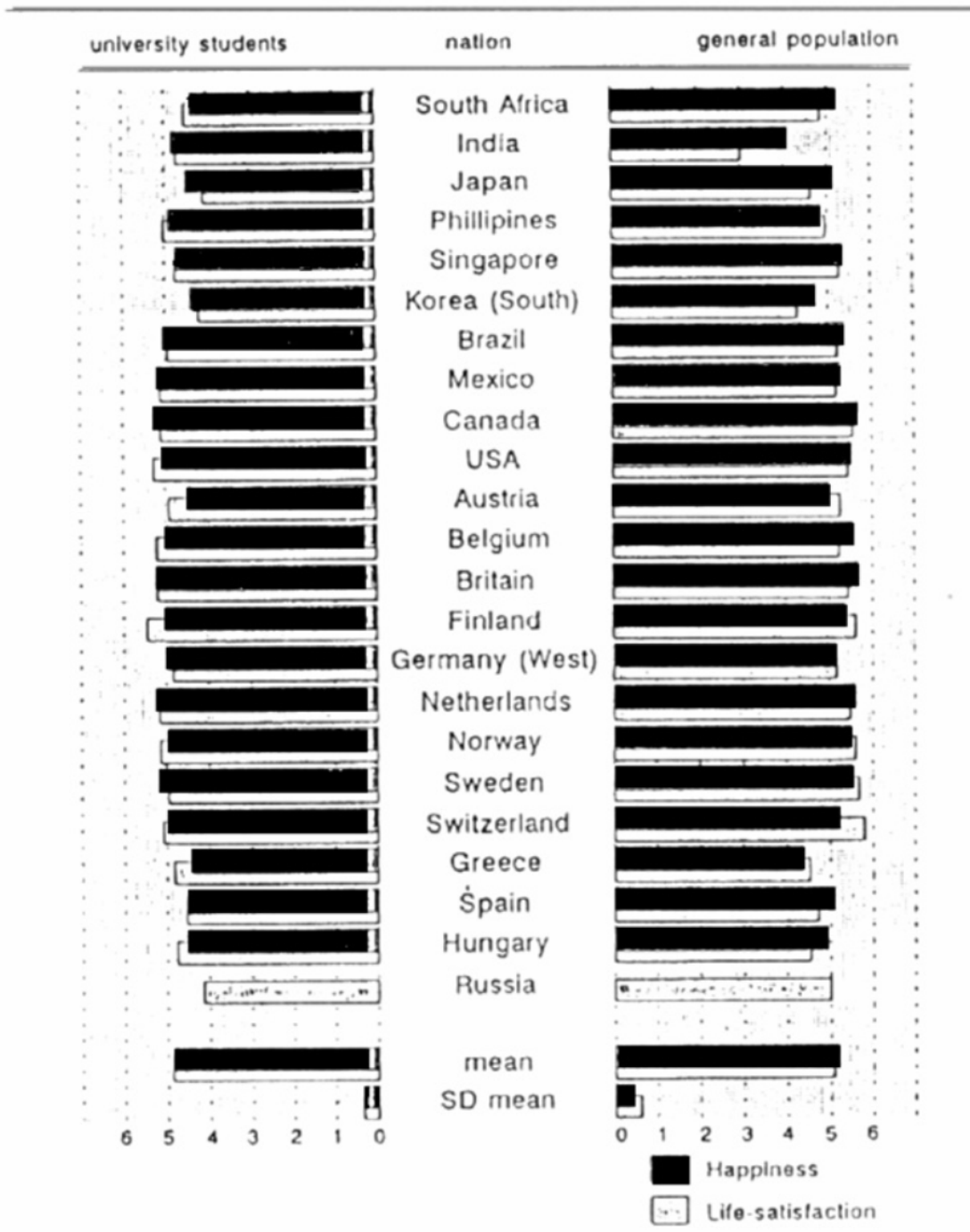
Level of Happiness in Nations Average scores on two items by students and general public in 23 nations in the 1980's