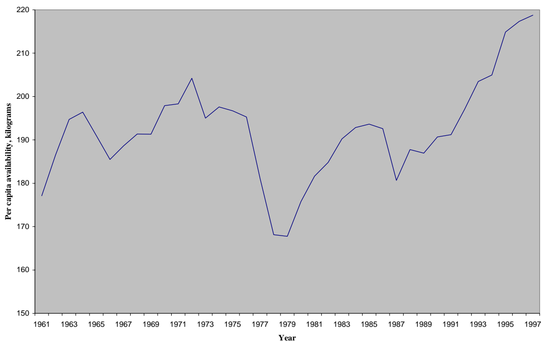
Figure 1: Per capita foodgrain availability, 1961-1997

Source: author's calculations from Food and Agriculture Organization, 1999 6 .